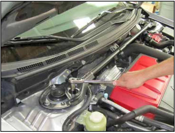
b. With the car on the ground, Use a 14mm socket to remove the (6) strut top nuts