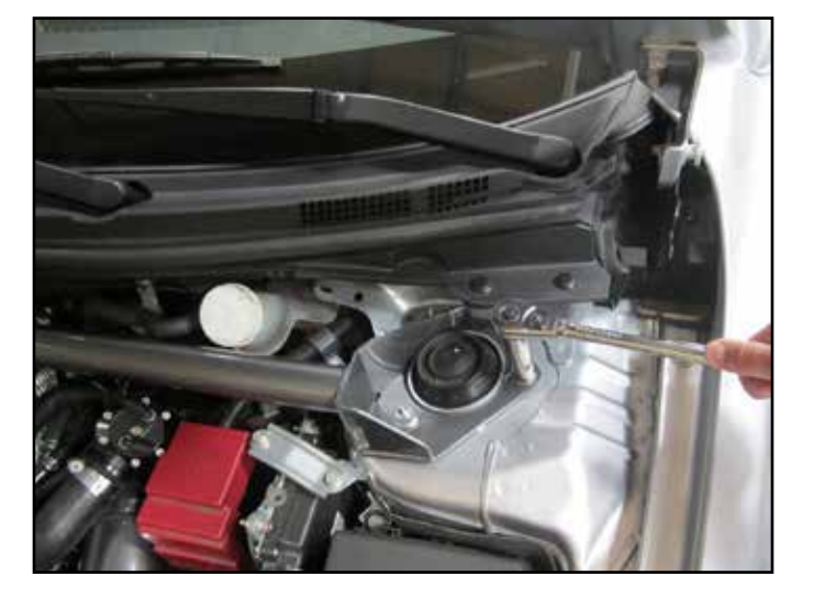
d. Using a 14mm socket, replace the strut tower nuts

For technical inquiries e-mail us at sales@aemintakes.com or call us at 800.992.3000