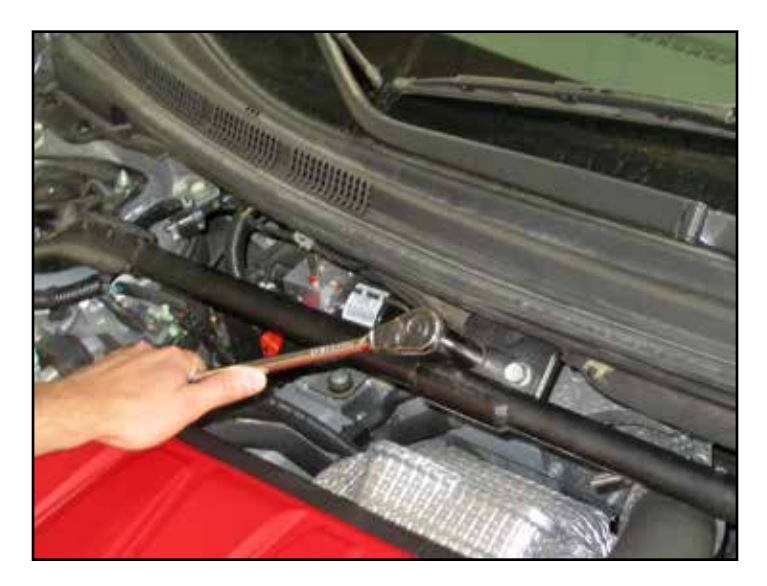
a. Using a 14mm socket, remove the (2) bolts holding the stock strut bar to the firewall bracket