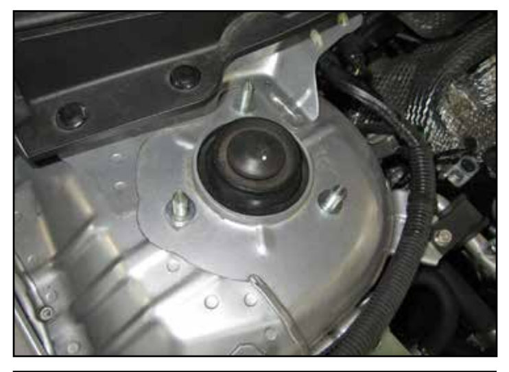
a. Place the (6) washers over the strut top studs