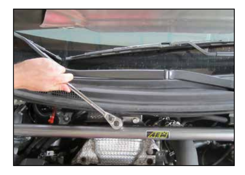
c. Using a 14mm socket, replace the firewall bolts

b. Place the AEM strut tower over the strut tower studs