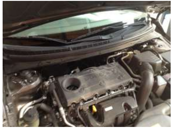
a. Remove the front and inside strut top nuts, that will be used to secure the AEM Strut Bar.