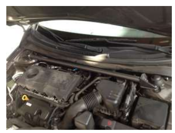
b. Place the AEM Strut Tower Bar over the strut top studs and washers, and replace the strut top nuts.