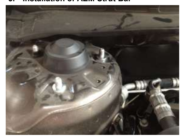
a. Place two (2) included washers over each of the strut top studs, as shown.