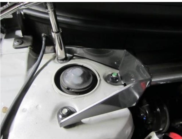
a. Install the AEM Strut Tower Bar, re-install the strut tower nuts, and torque to 43.4 ft-lb.