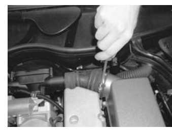
12. Tighten hose clamp. NOTE: Make sure that the hose clamp is snug.