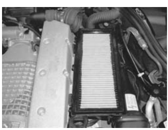
8. Install the K&N FILTERCHARGER® air filter into the airbox

7. Remove the dirty air filter from the airbox. With a damp rag wipe off any dust or dirt that might be inside the airbox lid and base.