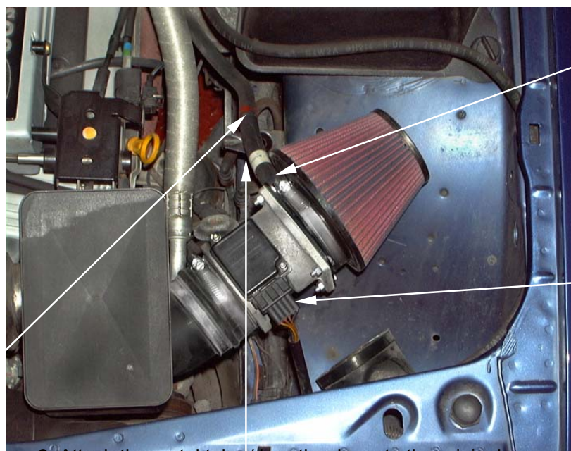
3. Attach the metal tube / breather hose to the original breather hose and secure with the original clip.