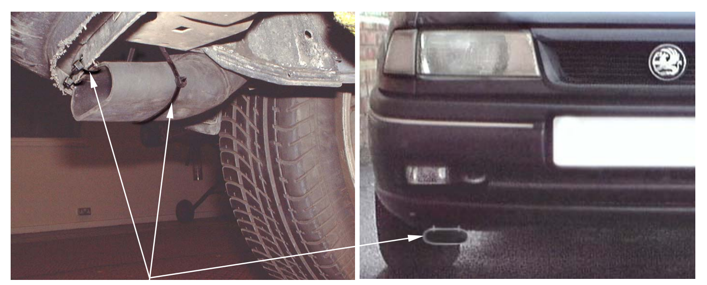
Pierce / drill two 3mm holes in the front bumper trim, secure the new cold air scoop to the front bumper using 2 plastic ties. Insert the flexi cold air hose into the new scoop, secure the scoop to a hole in the cross member with a long plastic tie.