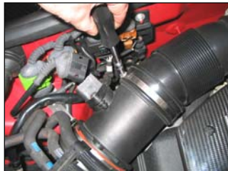
Fig. # 18