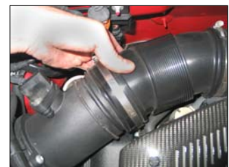
Fig. # 4