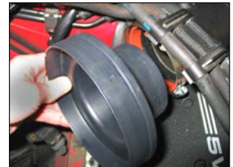
Fig. # 20