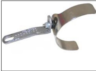
Fig. # 13