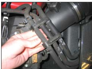
Fig. # 5