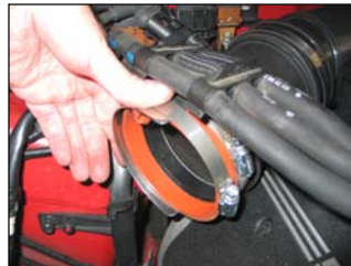
Fig. # 19