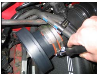
Fig. # 21