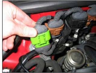
Fig. # 11