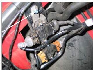
Fig. # 26