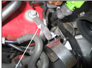
Fig. # 14