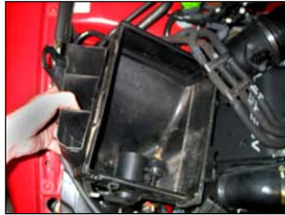
Fig. # 10