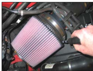
Fig. # 22