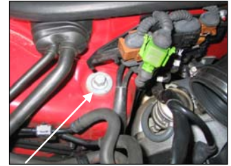
Fig. # 12