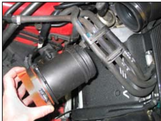
Fig. # 17