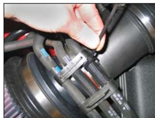
Fig. # 27