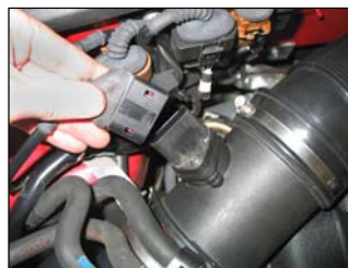
Fig. # 23