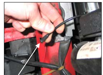
Fig. # 24