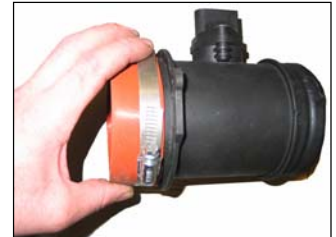
Fig. # 16