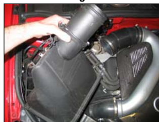
Fig. # 7