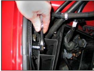
Fig. # 9