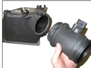
Fig. # 15