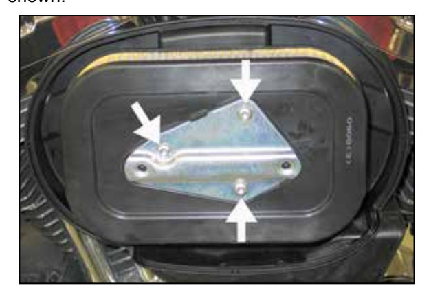
3. Remove the three air filter mounting bolts shown.