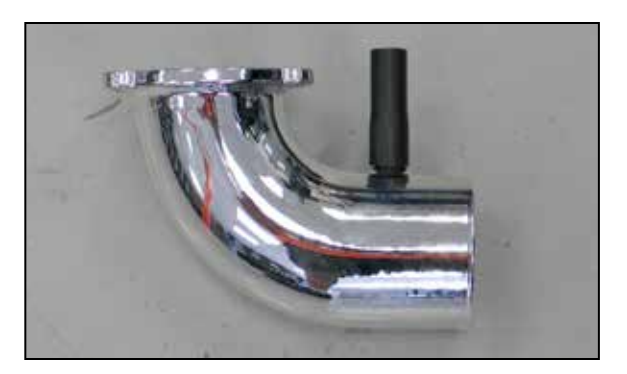
9. Cut the provided crankcase vent hose to a length of 1.75" and install onto the K&N® intake tube as shown.