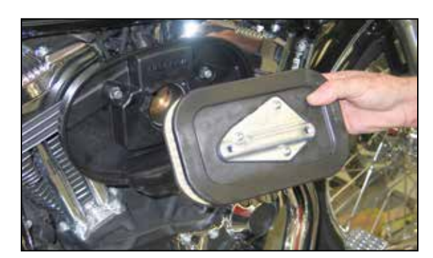
4. Remove the air filter as shown.