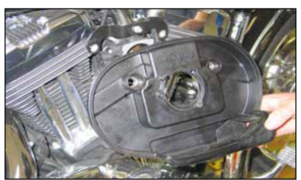
6. Remove the air filter base as shown. NOTE: K&N Engineering, Inc. recommends that customers do not discard the factory air intake components.