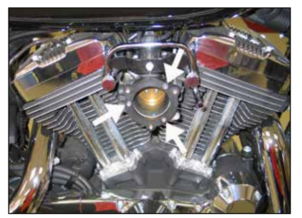
8. Install the K&N® intake tube adapter onto the throttle body using the provided hardware. NOTE: Apply one drop of the provided thread locker to the three tube adapter mounting bolts.