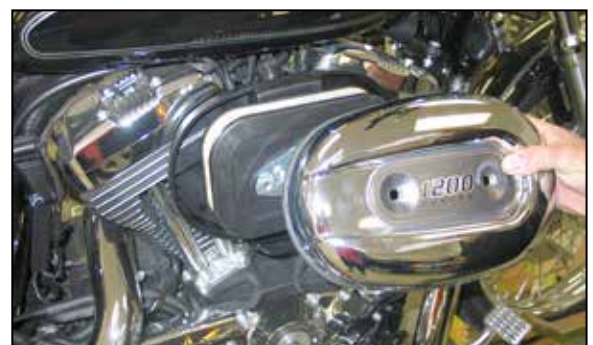
2. Remove the two air filter cover mounting bolts and then remove the cover from the vehicle as shown.

1. Turn off the ignition and disconnect the negative battery cable.