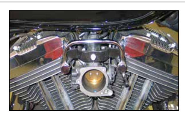
7. Install the K&N® crankcase breather tube onto the vehicle using the provided hardware. NOTE: Do not completely tighten the breather bolts at this time.