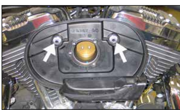
5. Remove the two breather bolts shown.