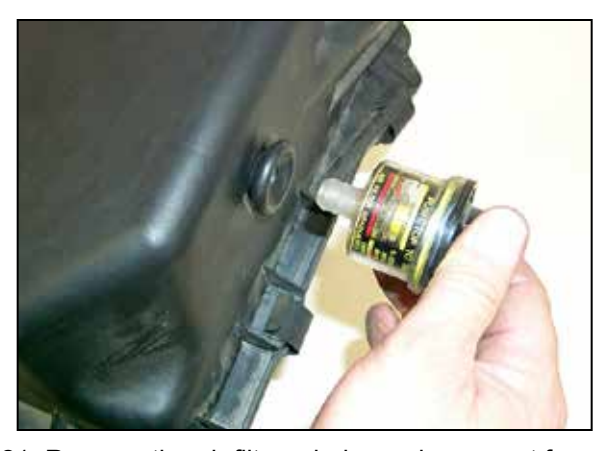
21. Remove the air filter minder and grommet from the stock air box lid as shown.