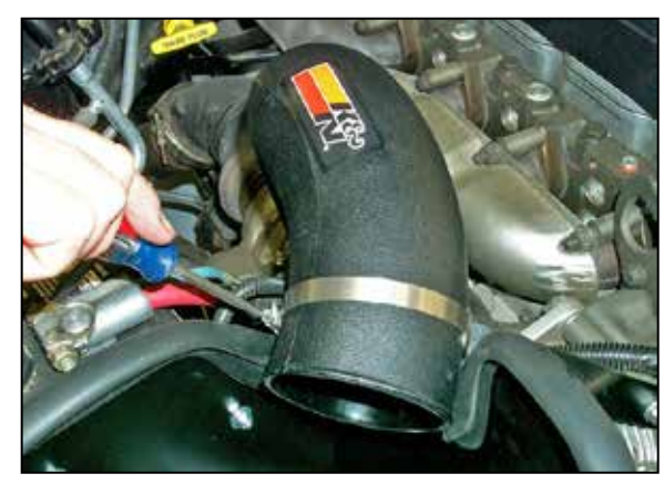
22. Install the intake tube onto the turbo inlet, then align with the saddle bracket. Attach the saddle bracket to the intake tube with the provided hose clamp, adjust the bracket to achieve the appropriate clearance for the intake tube before tightening.