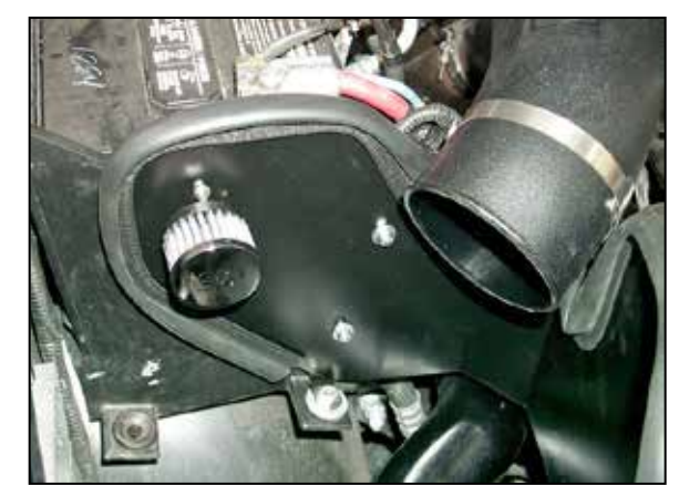
24. Install the K&N® air filter onto the air temperature sensor as shown.