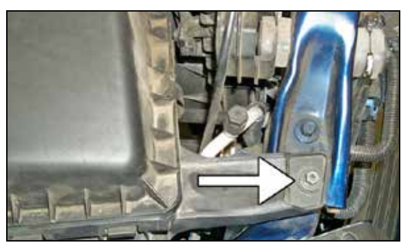
5. Loosen and remove the 10mm nut that retains the air box to the vehicle.