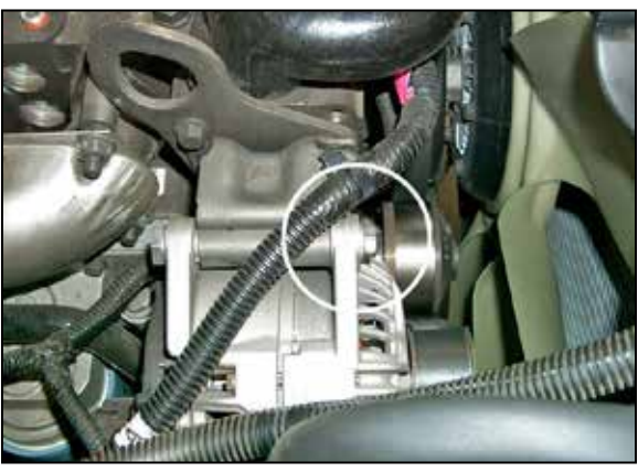
18. Remove the upper alternator bolt.