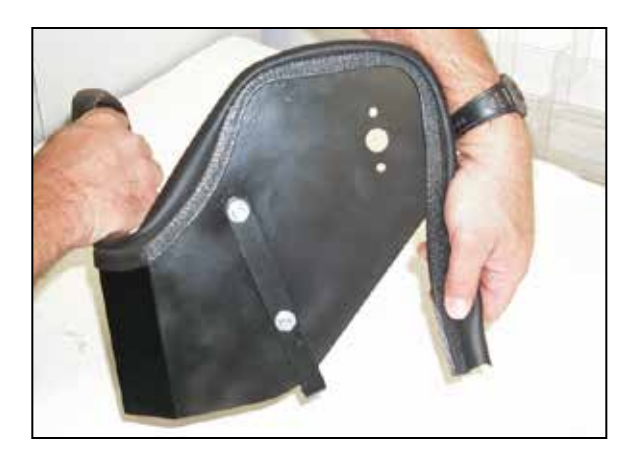
10. Install the edge trim onto the heat shield as shown.