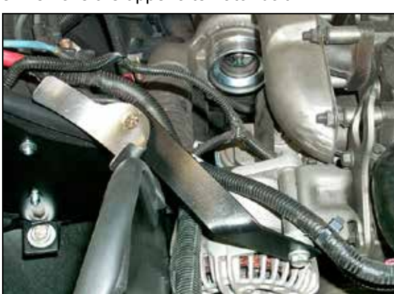
19. Install the saddle bracket assembly onto the alternator with the bolt that was removed in the previous step.