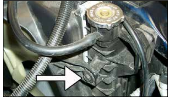
13. Remove the bolt that retains the fan shroud to the radiator.