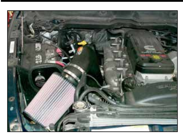
26. Reconnect the vehicle's negative battery cable. Double check to make sure everything is tight and properly positioned before starting the vehicle.