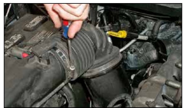
3. Loosen the hose clamps at the turbo inlet and the air box outlet as shown.