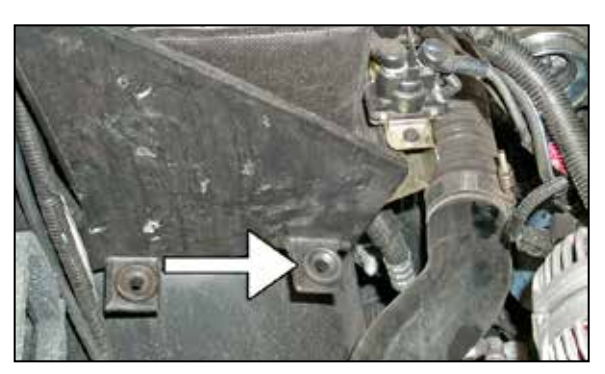
7. Remove the air box mounting grommet as shown.

NOTE: K&N Engineering, Inc., recommends that customers do not discard factory air intake.