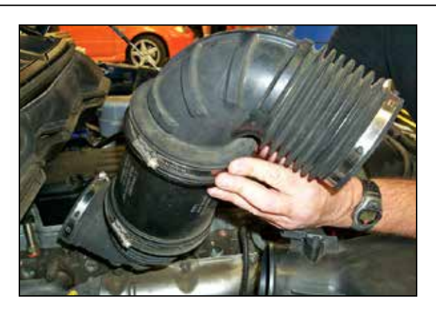
4. Remove the intake tube from the vehicle as shown.