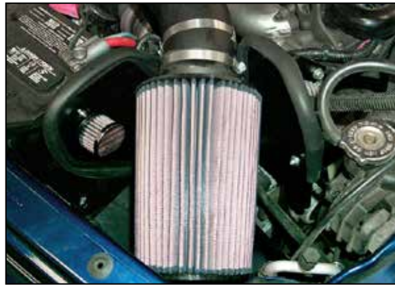
25. Install the K&N® air filter onto the intake tube as shown.