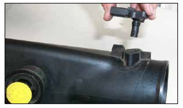
11. Remove the temperature sensor from the air box lid using an 9/32 socket.