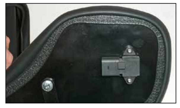
12. Install the temperature sensor onto the heat shield with the provided hardware as shown.