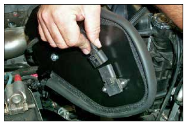
15. Reconnect the air temperature sensor electrical connection as shown.