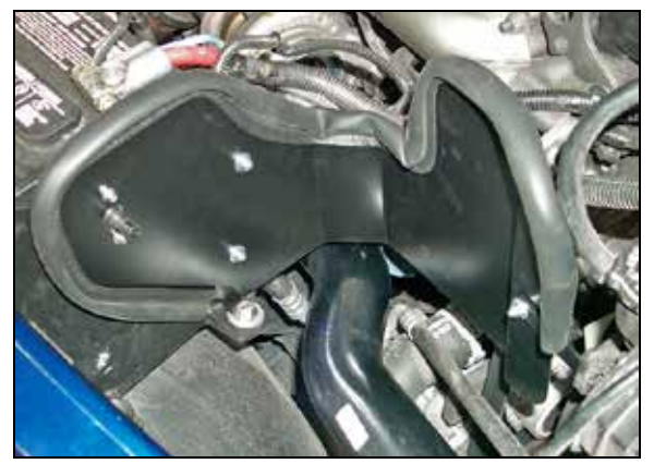
16. Install the heat shield onto the vehicle with the provided hardware.

NOTE: Use the 8mm bolt to fasten the heat shield to the fan shroud.