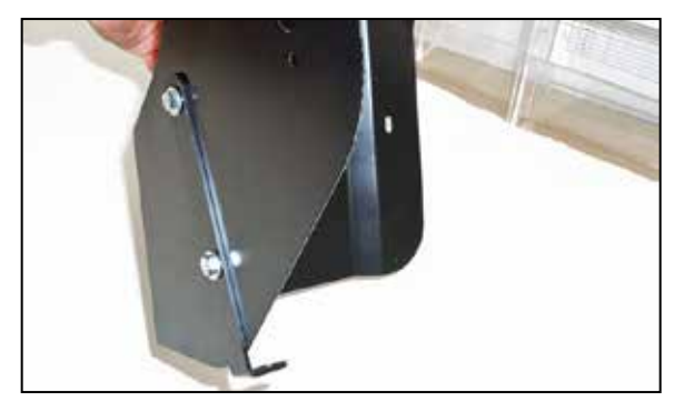
8. Install the large "L" bracket onto the heat shield with the provided hardware.