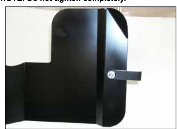
9. Install the short "L" bracket onto the heat shield with the provided hardware.