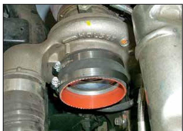
20. Install the silicone hose (08761) onto the turbo with the provided hose clamp.