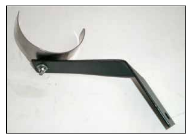
17. Assemble the saddle bracket onto the "L" bracket using the provided hardware.

NOTE: Use the 8mm bolt to fasten the heat shield to the fan shroud.