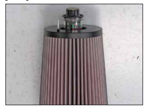
23. Install the grommet and air filter minder that was removed in step 21 onto the K&N® air filter as shown.