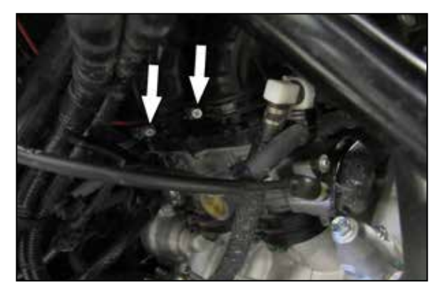
5. Loosen the two hose clamps that secure the intake hose to the throttle bodies.