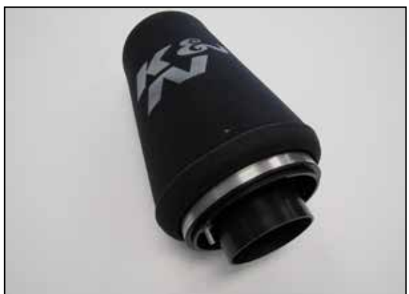
19. Install the K&N air filter onto the filter adapter and secure with the provided hose clamp, then install the foam filter wrap onto the air filter.