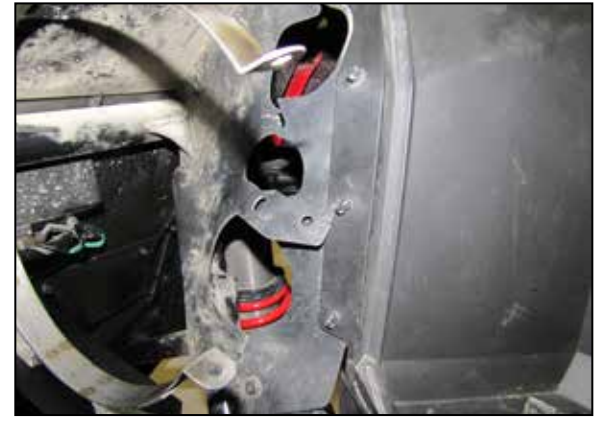
22. Remove the retaining clips and then remove the fresh air duct seal.