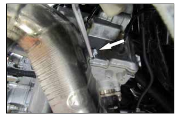
8. Remove the bolt that secures the air filter housing bracket to the exhaust.