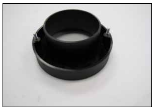
18. Install the two provided studs into the filter adapter as shown.