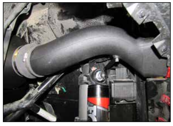
27. Install the fresh air duct into the coupler and then align the bracket, adjust the duct for best fit and then secure with the provided hardware and hose clamps.