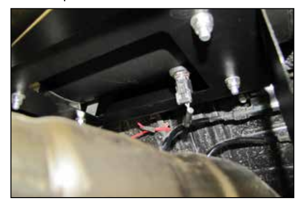
24. Reconnect the inlet air temperature sensor electrical connection.