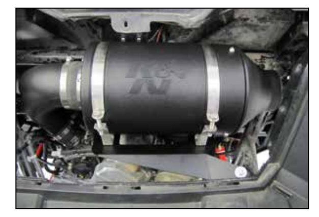
23. Install the K&N air filter assembly along with the provided large hump coupler. Secure the housing with the clamps and secure the coupler with the hose clamps.