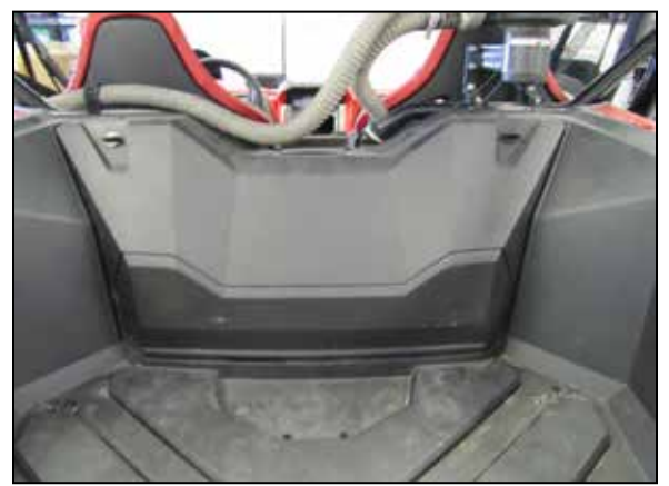
29. Reinstall the air filter access panel and secure with the factory quarter turn fasteners.

30. Reconnect the vehicle's negative battery cable. Double check to make sure everything is tight and