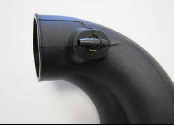
12. Install the 90deg vent fitting into the K&N intake tube as shown.

11. Install the bracket assembly into the position and secure with the provided hardware.