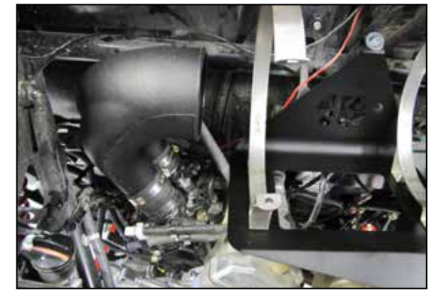
17. Install the K&N intake tube into the couplers at the throttle bodies and secure with the provided hose clamps. Connect the CCV hose to the fitting installed into the K&N intake tube and secure with the provided clamp.