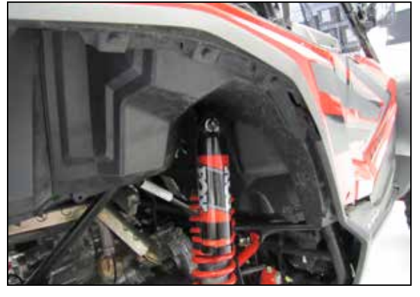
28. Reinstall the fresh air intake duct cover and the original mounting clips.