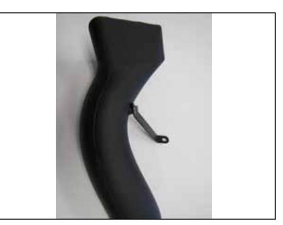
26. Install the fresh air duct mounting bracket onto the K&N fresh air duct using the provided hardware.