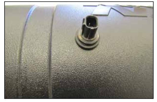
16. Remove the inlet air temperature sensor from the factory air filter housing and install it into the grommet installed into the K&N housing.