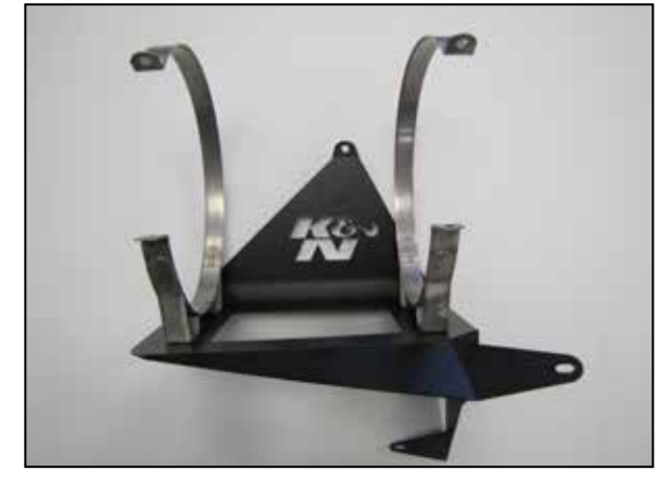
10. Install the two provided canister mounting bracket clamps onto the mounting bracket.

9. Partially remove the air filter system and then disconnect the inlet air temperature sensor electrical connection. Now remove the air filter assembly completely from the vehicle.