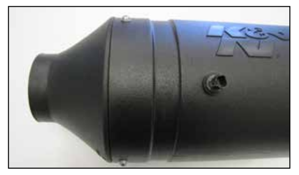
21. Install the housing lid and secure with the provided hardware