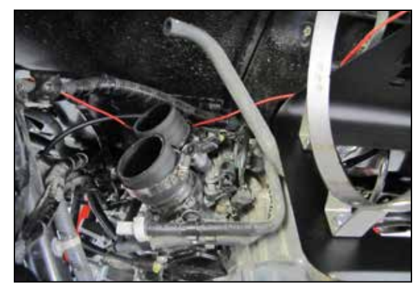
13. Install the two provided couplers onto the throttle bodies as shown and secure with the provided hose clamps.