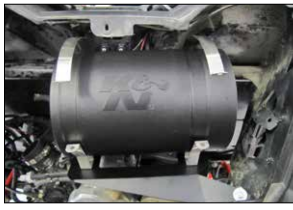
14. Place the K&N air filter housing into position on the clamps, using the factory inlet air temperature sensor wiring harness as a guide mark the housing for a drill point.