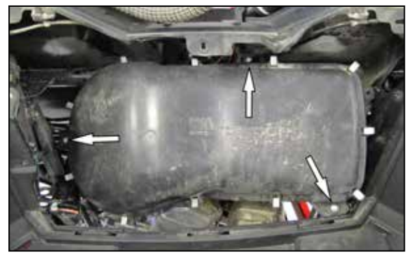
7. Remove the three bolts that secure the air filter housing.

6. Remove the air filter housing drain hose shown.