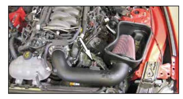
19. Unhook the mass air sensor wiring harness from the inner fender and then route to the mass air sensor and reconnect.

NOTE: Drycharger® air filter wrap; part # RF-1020DK is available to purchase separately. To learn more about Drycharger® filter wraps or look up color availability please visit http://www.knfilters.com®.