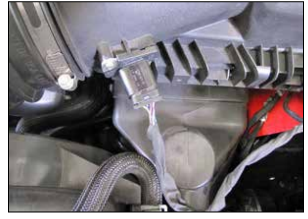
4. Disconnect the mass air sensor electrical connection.