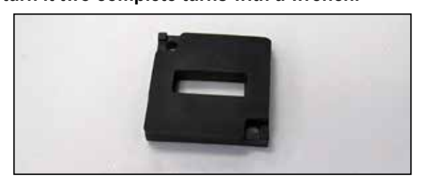
10. Install the provided gasket onto the K&N ^{\!0} mass air sensor adapter.

NOTE: Plastic NPT fittings are easy to cross thread. Install the vent fitting "hand" tight, then turn it two complete turns with a wrench.