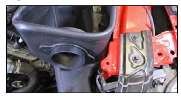
14. Install the filter adapter into the K&N® air filter housing and then install the tube gasket onto the adapter.

NOTE: Be sure the threaded inserts in the adapter are aligned with the holes in the housing and gasket.