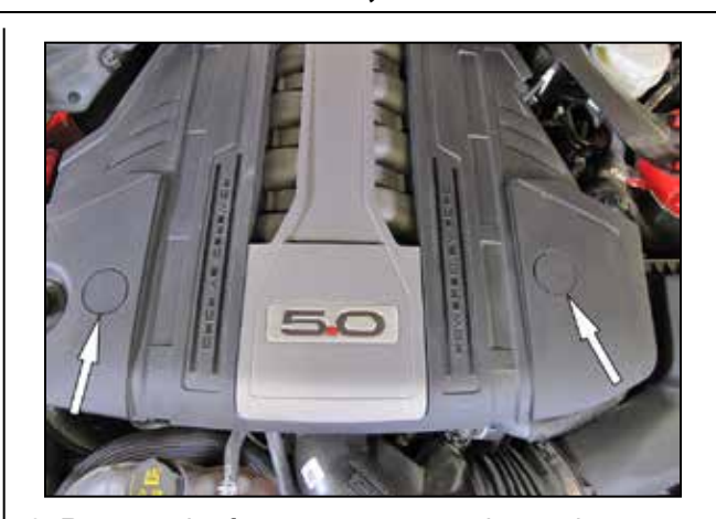
3. Remove the fastener covers on the engine cover, remove the two nuts that secure the cover and then remove the cover from the engine.