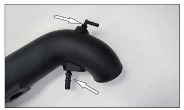
9. Install the provided fittings into the K&N<sup>®</sup> intake tube as shown.

NOTE: Plastic NPT fittings are easy to cross thread. Install the vent fitting "hand" tight, then turn it two complete turns with a wrench.