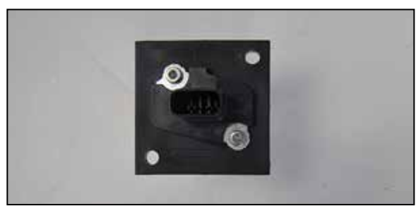
11. Remove the mass air sensor from the factory air filter housing and install it into the K&N® adapter using the provided hardware.