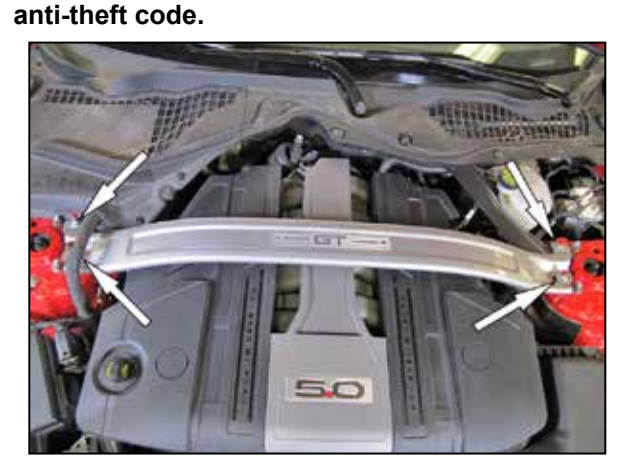
2. Remove the four nuts that secure the strut tower brace and then remove the strut tower brace from the vehicle.

NOTE: Disconnecting the negative battery cable erases pre-programmed electronic memories. Write down all memory settings before disconnecting the negative battery cable. Some radios will require an anti-theft code to be entered after the battery is reconnected. The anti-theft code is typically supplied with your owner's manual. In the event your vehicles anti-theft code cannot be recovered, contact an authorized dealership to obtain your vehicles