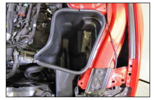
8. Install the provided edge trim onto the K&N® air filter housing. Install the K&N® air filter housing into the vehicle and secure with the provided hardware. NOTE: Some trimming of the edge trim will be necessary.