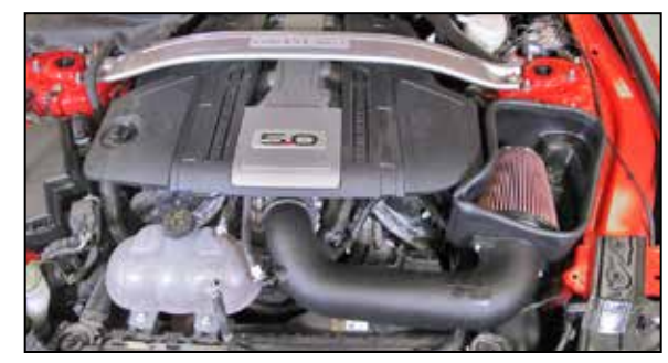
21. Reconnect the vehicle's negative battery cable. Double check to make sure everything is tight and properly positioned before starting the vehicle.

22. It will be necessary for all K&N® high flow intake systems to be checked periodically for realignment, clearance and tightening of all connections. Failure to follow the above instructions or proper maintenance may void warranty.