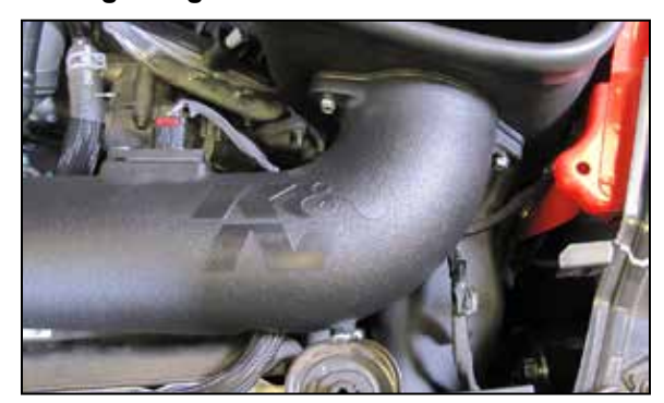
15. Install the intake tube into the coupler at the throttle body and onto the filter adapter, secure the tube to the filter adapter with the provided hardware and to the coupling hose with the provided hose clamp.

NOTE: Be sure the threaded inserts in the adapter are aligned with the holes in the housing and gasket.