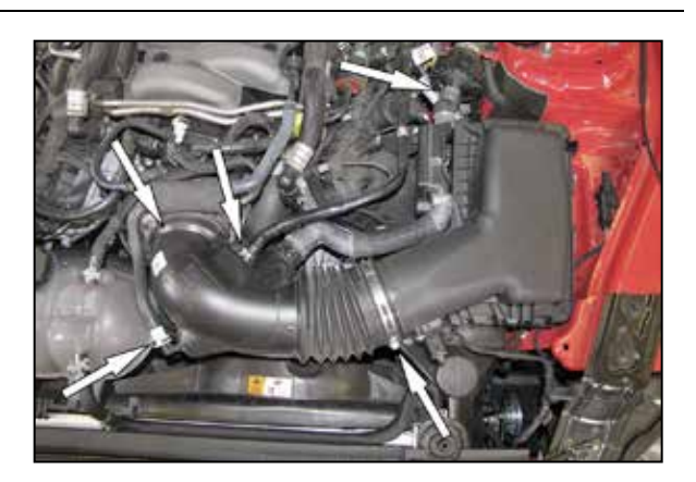
5. Disconnect the EVAP vent line, cut the clamp for the sound tube at the sound drum and disconnect the hose from the drum. Loosen the hose clamps that secure the intake tube to the throttle body and air filter housing then remove the intake tube from the vehicle.