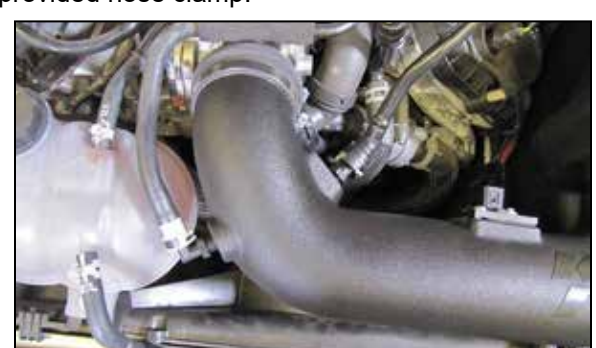
16. Connect the EVAP and crank case vent lines to the fittings installed into the K&N® intake tube.