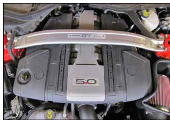
20. Reinstall the engine cover and secure with the factory hardware, reinstall the nut covers. Reinstall the strut tower brace and secure with the factory nuts.