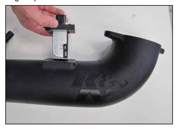
12. Install the mass air sensor assembly into the K&N® intake tube as shown and secure with the provided hardware.