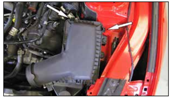
6. Release the clips that secure the upper air filter housing and then remove the upper air filter housing from the vehicle.