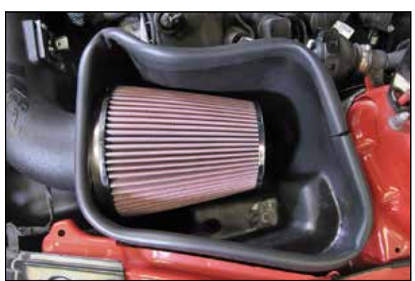
18. Install the K&N® air filter onto the filter adapter and secure with the provided hose clamp.

NOTE: Drycharger® air filter wrap; part # RF-1020DK is available to purchase separately. To learn more about Drycharger® filter wraps or look up color availability please visit http://www.knfilters.com®.