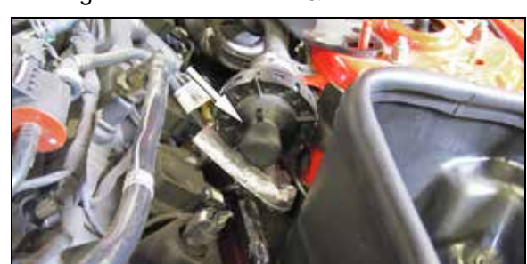
17. Install the provided cap onto the sound drum as shown.