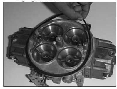
Apply the provided K&N gasket onto carburetor