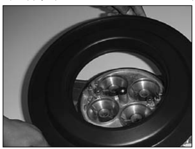
3) Place K&N base plate onto carburetor.