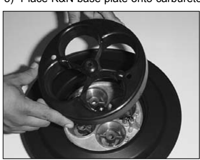
4) Place the K&N Flow Control Stub Stack onto base plate. NOTE: make sure the spacer remains in place when placing the stub stack onto the carb post.