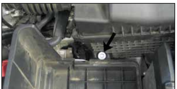
6. Loosen the bolt which secures the lower airbox to the battery tray.