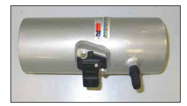
18. Install the mass air sensor into the K&N<sup>®</sup> intake tube and secure with the provided hardware.