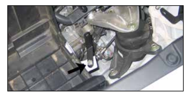
12. Install the heat shield mounting bracket (070115) onto the airbox mounting location on the battery tray using the provided hardware.