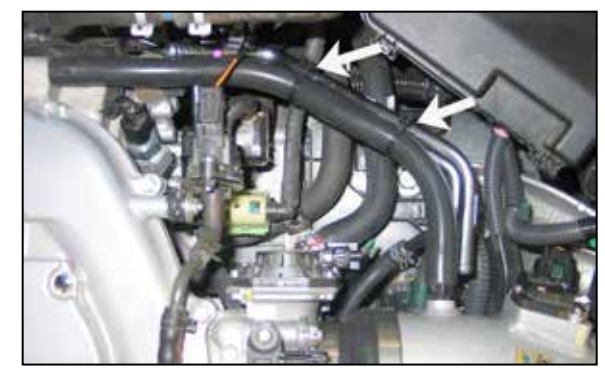
20. Install the provided crankcase vent hose onto the NPT fitting and then onto the valve cover port. Secure the crankcase hard line to the provided hose with the tie wraps provided.

NOTE: On Acura vehicles, install the provided spacer in-between the mounting bracket and tube, then secure with the longer 6mm bolt provided.