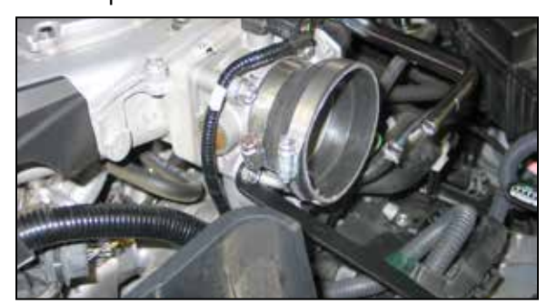
15. Install the silicone hose (084093) onto the throttle body and secure with the provided hose clamp

NOTE: Some models may be equipped with a larger 3-1/4"od throttle body. It will be necessary to use the provided coupling hose #08051 and the #52 hose clamp on those with the larger throttle body.