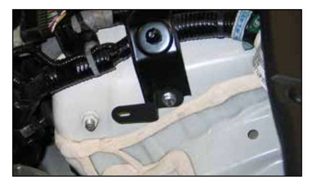
11. On Honda vehicles, install the heat shield mounting bracket (070116) onto the air box mounting bracket and secure with the provided hardware.