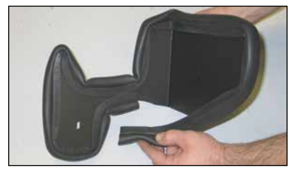
13. Install the provided edge trim onto the heat shield as shown.

NOTE: Some trimming of the edge trim will be necessary.