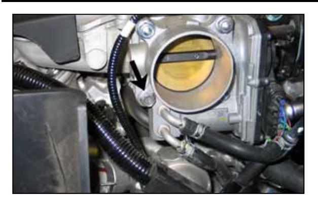
8. Remove the front lower throttle body bolt shown. NOTE: This bolt will be reused in the next step.