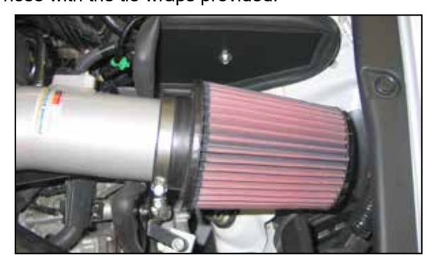
21. Install the K&N® air filter onto the intake tube and secure with the provided hose clamp. NOTE: Drycharger® air filter wrap; part # RC-4630DK is available to purchase separatel

RC-4630DK is available to purchase separately. To learn more about Drycharger® filter wraps or look up color availability please visit http://www.knfilters.com®.