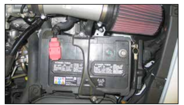
22. Reinstall the battery and secure with the hold down bracket. Reconnect the positive battery cable.

RC-4630DK is available to purchase separately. To learn more about Drycharger® filter wraps or look up color availability please visit http://www.knfilters.com®.