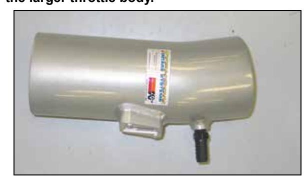
16. Install the \frac{1}{4} " NPT fitting into the K&N® intake tube as shown.

NOTE: Some models may be equipped with a larger 3-1/4"od throttle body. It will be necessary to use the provided coupling hose #08051 and the #52 hose clamp on those with the larger throttle body.