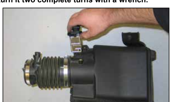
17. Remove the mass air sensor from the stock airbox.

NOTE: Plastic NPT fittings are easy to cross thread. Install the vent fitting "hand" tight, then turn it two complete turns with a wrench.