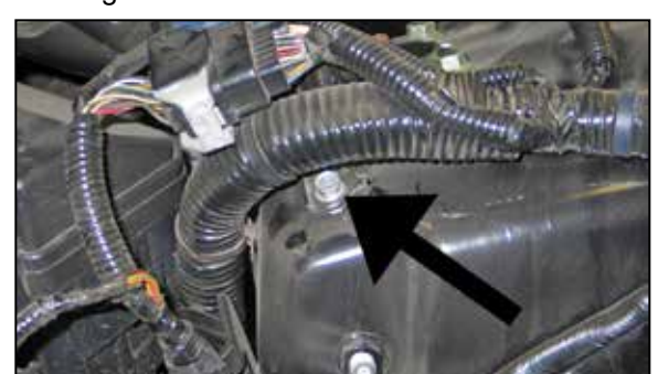
10a. On Acura vehicles, remove the bolt shown that secures the wiring harness mounting bracket to the strut tower.