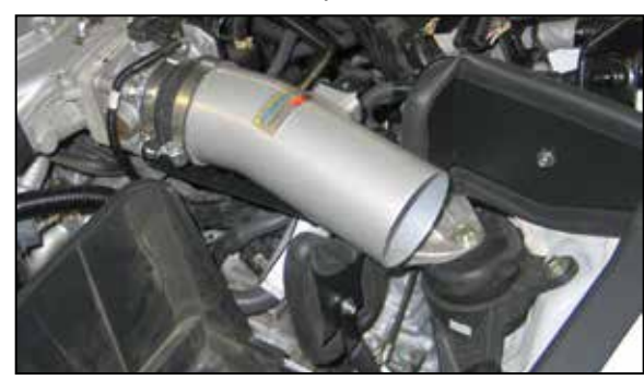
19. Install the K&N® intake tube into the silicone hose at the throttle body and align with the mounting bracket. Secure with the hose clamp and provided hardware.

NOTE: On Acura vehicles, install the provided spacer in-between the mounting bracket and tube, then secure with the longer 6mm bolt provided.