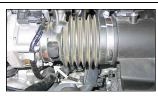
5. Loosen the hose clamp which secures the stock intake tube to the throttle body.

NOTE: Acura vehicles have a side and front engine cover that will need to be removed before performing this step.