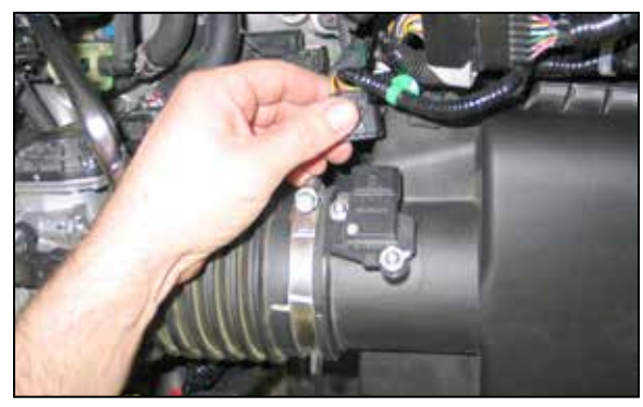
3. Disconnect the mass air sensor electrical connection.