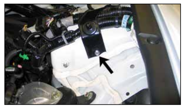
10. On Honda vehicles, remove the airbox mounting bracket bolt shown.