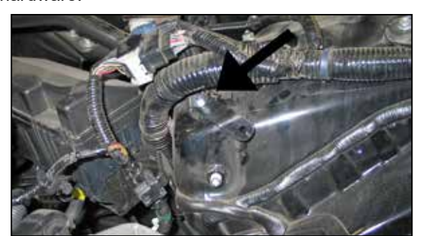
11a. On Acura vehicles Install the heat shield mounting bracket (083158) onto the strut tower and secure with the provided hardware.