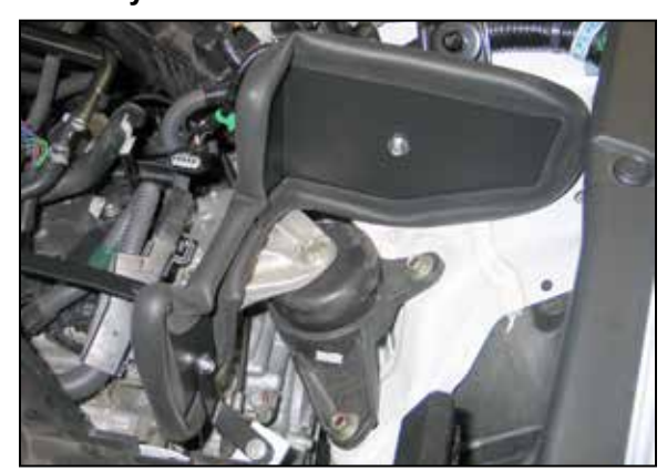
14. Install the heat shield assembly into the vehicle and secure to the mounting brackets with the hardware provided.

NOTE: Some trimming of the edge trim will be necessary.