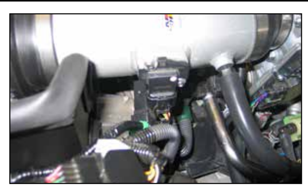
23. Reconnect the mass air sensor electrical connection.