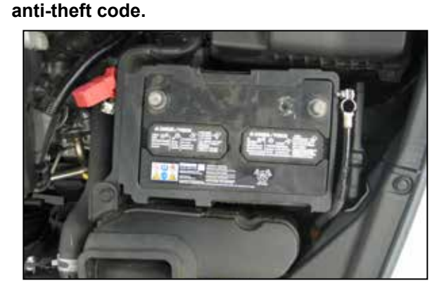
2. Disconnect the positive battery cable, remove the battery hold down and then remove the battery.

NOTE: Disconnecting the negative battery cable erases pre-programmed electronic memories. Write down all memory settings before disconnecting the negative battery cable. Some radios will require an anti-theft code to be entered after the battery is reconnected. The anti-theft code is typically supplied with your owner's manual. In the event your vehicles' anti-theft code cannot be recovered, contact an authorized dealership to obtain your vehicles