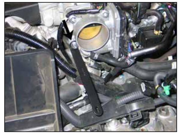
9. Install the tube mounting bracket (070114) onto the throttle body and secure with the bolt removed in the previous step.