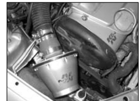
Apollo without end cap / cold air hose fitted