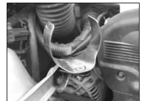
K&N saddle bracket (K&N accessories)