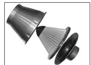
K&N Apollo stripped for element cleaning