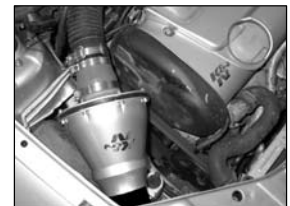
Apollo with end cap / cold air hose fitted