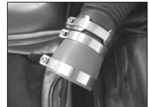
K&N rubber hose adaptor (K&N accessories)