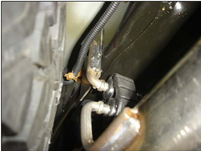
Dia # 3

Warning: When working on, under, or around any vehicle exercise caution. Please allow the vehicle's exhaust system to cool before removal, as exhaust system temperatures may cause severe burns. If working without a lift, always consult vehicle manual for correct lifting specifications. Always wear safety glasses and ensure a safe work area. Serious injury or death could occur if safety measures are not followed.