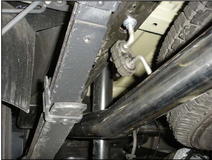
Dia # 2

2010– NISSAN TITAN 5.6L V8 CC–EC/SB DUAL REAR EXIT