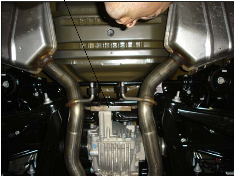
Fig. # 1

Step 5: Once a final position has been chosen for the new system, evenly tighten all fasteners from front to rear. The supplied band clamps must be VERY tight to properly align the pipes and prevent leaks (Approximately 65ft-lbs). U-bolt clamps should be tightened to approximately 30-35ft-lbs. Inspect all fasteners after 25-50 miles of operation and retighten if necessary.