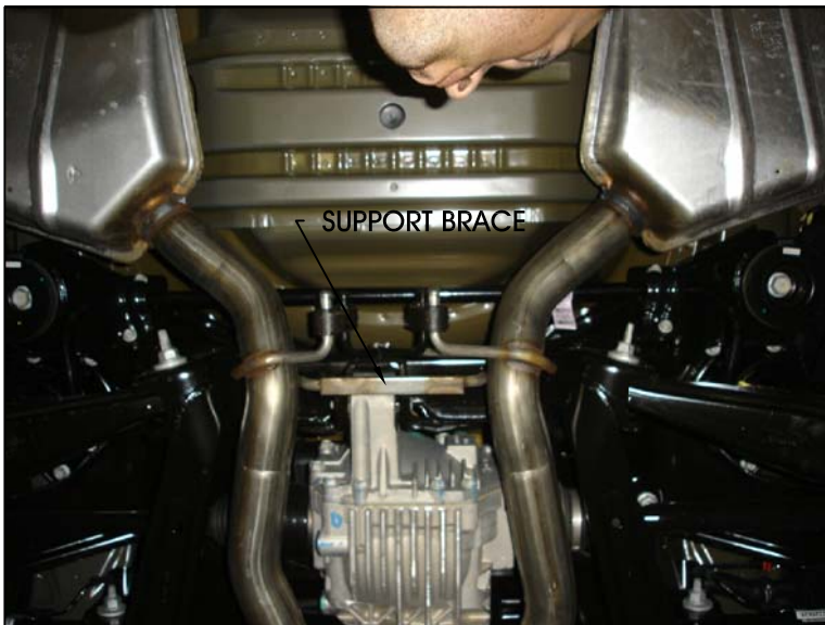
Fig. # 1

Step 5: Once a final position has been chosen for the new system, evenly tighten all fasteners from front to rear. The supplied band clamps must be VERY tight to properly align the pipes and prevent leaks (Approximately 65ft-lbs). U-bolt clamps should be tightened to approximately 30-35ft-lbs. Inspect all fasteners after 25-50 miles of operation and retighten if necessary.