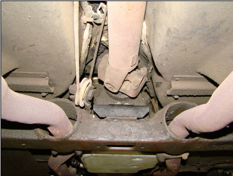
Fig # 1

Step 4: Once a final position has been chosen for the new system, evenly tighten all fasteners from front to rear. The supplied band clamps must be VERY tight to properly align the pipes and prevent leaks (Approximately 65ft-lbs). U-bolt clamps should be tightened to approximately 30-35ft-lbs. Inspect all fasteners after 25-50 miles of operation and retighten if necessary.