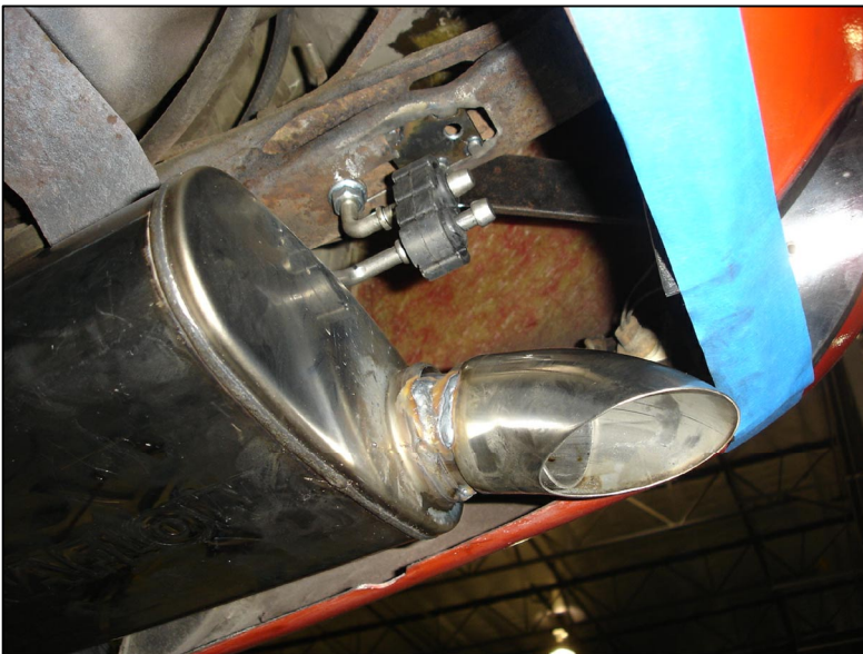
Fig # 2

Step 4: Once a final position has been chosen for the new system, evenly tighten all fasteners from front to rear. The supplied band clamps must be VERY tight to properly align the pipes and prevent leaks (Approximately 65ft-lbs). U-bolt clamps should be tightened to approximately 30-35ft-lbs. Inspect all fasteners after 25-50 miles of operation and retighten if necessary.