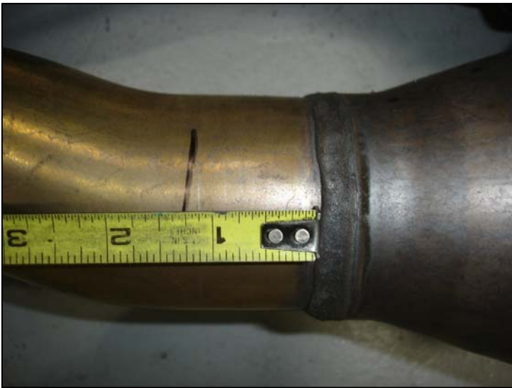
Fig # 1

Warning: When working on, under, or around any vehicle exercise caution. Please allow the vehicle's exhaust system to cool before removal, as exhaust system temperatures may cause severe burns. If working without a lift, always consult vehicle manual for correct lifting specifications. Always wear safety glasses and ensure a safe work area. Serious injury or death could occur if safety measures are not followed.