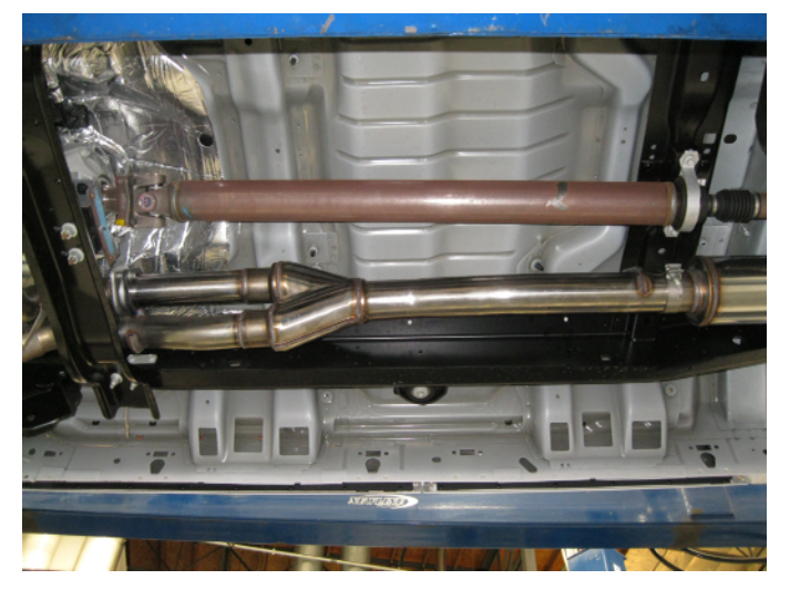
Step 2. Install the new system by attaching the Inlet Y-Pipe Assembly to the OEM catalytic converter outlet pipes using the existing clamp and hardware. Locate the welded hanger to the rubber insulator. Leave all clamps and fasteners loose for final adjustment of the complete system once installed.