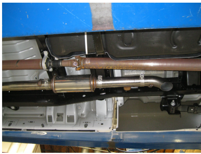
Step 4. Install the Muffler, Tail Pipe Assembly and Extension Pipe Assembly (if needed) using the supplied 3.50" clamps. Locate the welded hangers to the OEM rubber insulators.