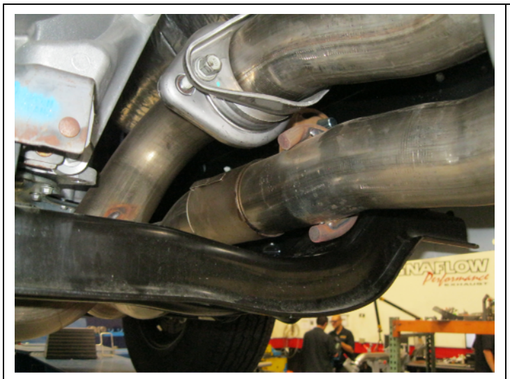
Step 1. To remove the OEM exhaust system, unbolt the flange and clamp attaching the systems inlet pipes to the catalytic converter outlet pipes. Disengage all welded hangers from the OEM rubber insulators. Do not discard the OEM fasteners or damage the rubber insulators as they will be needed to mount your new MAGNAFLOW system.