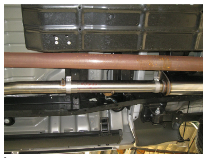
Step 3. Install the Muffler using the supplied 3.50" clamp. Use the supplied 16.00" Extension Pipe between the Muffler and the Tail Pipe Assembly if your truck uses the Crew Cab Long Bed or the Extended Cab Short Bed configuration. If your truck has a Crew Cab with the Short Bed the 16.00" Extension Pipe is not used.