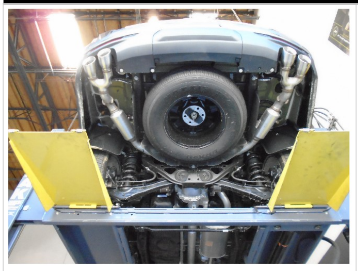
Step 1. To remove the OE exhaust system you will need to remove the spare tire, heat shield and sway bar.