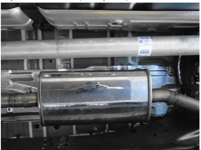
Step 5. Attach the Muffler Assembly to the Inlet Resonator Assembly with a supplied 3.00" clamp. Engage the welded hanger to the rubber insulator.

MAGNAFLOW: 1901 Corporate Centre Dr - Oceanside, CA 92056 | 1(800)990-0905 Technical Support: 1(800) 959-9226 | Email: moreinfo@magnaflow.com