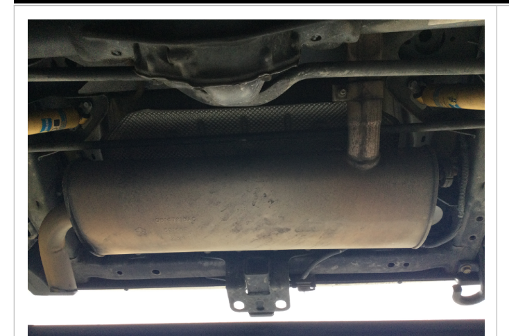
Step 1. Remove the OEM system by loosening the over-axle TORCA clamp. Then disconnect the OE rubber hangers and remove the OE muffler.