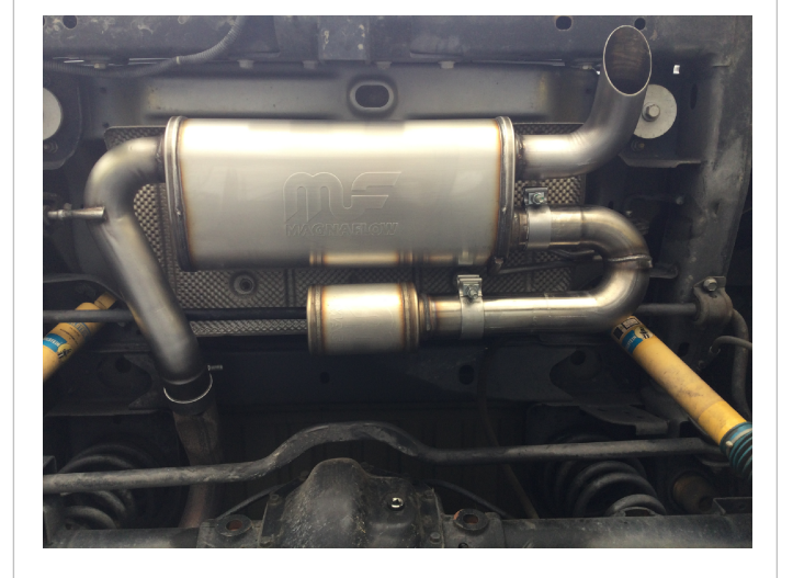
Step 2. Next, slide the MagnaFlow axle-back into the OE over-axle pipe and loosely clamp to hold in place. Then slide the hangers into the factory rubber insulaters. Next attach the NDT resonator and clamp in place.