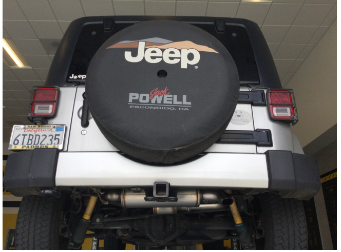
Step 3. Once a final position has been chosen for the new exhaust system, evenly tighten all clamps from front to rear using the torque specifications on page one of the instructions. Inspect all fasteners after 25-50 miles of operation and re-tighten if necessary.

MAGNAFLOW: 1901 Corporate Centre Dr - Oceanside, CA 92056 | 1(800)990-0905 Technical Support: 1(800) 959-9226 | Email: moreinfo@magnaflow.com