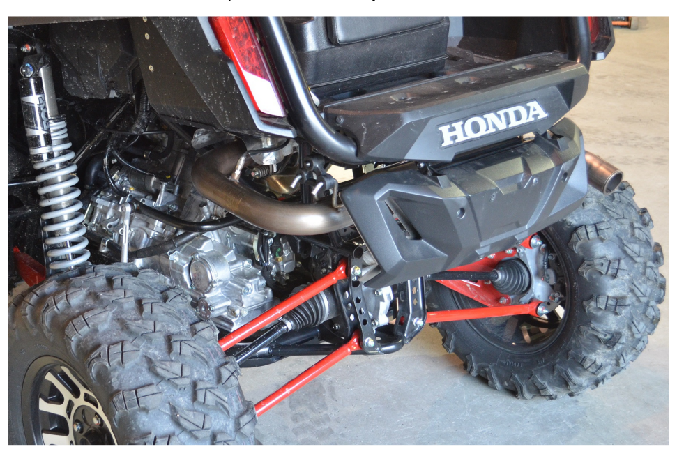
Congratulations! You are ready to begin experiencing the improved performance and driving excitement of your MBRP Exhaust upgrade. We know you will enjoy your purchase.