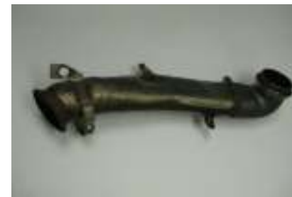
Stock Down Pipe Figure 6

23. Reinstall the inner fender liner and wheel.