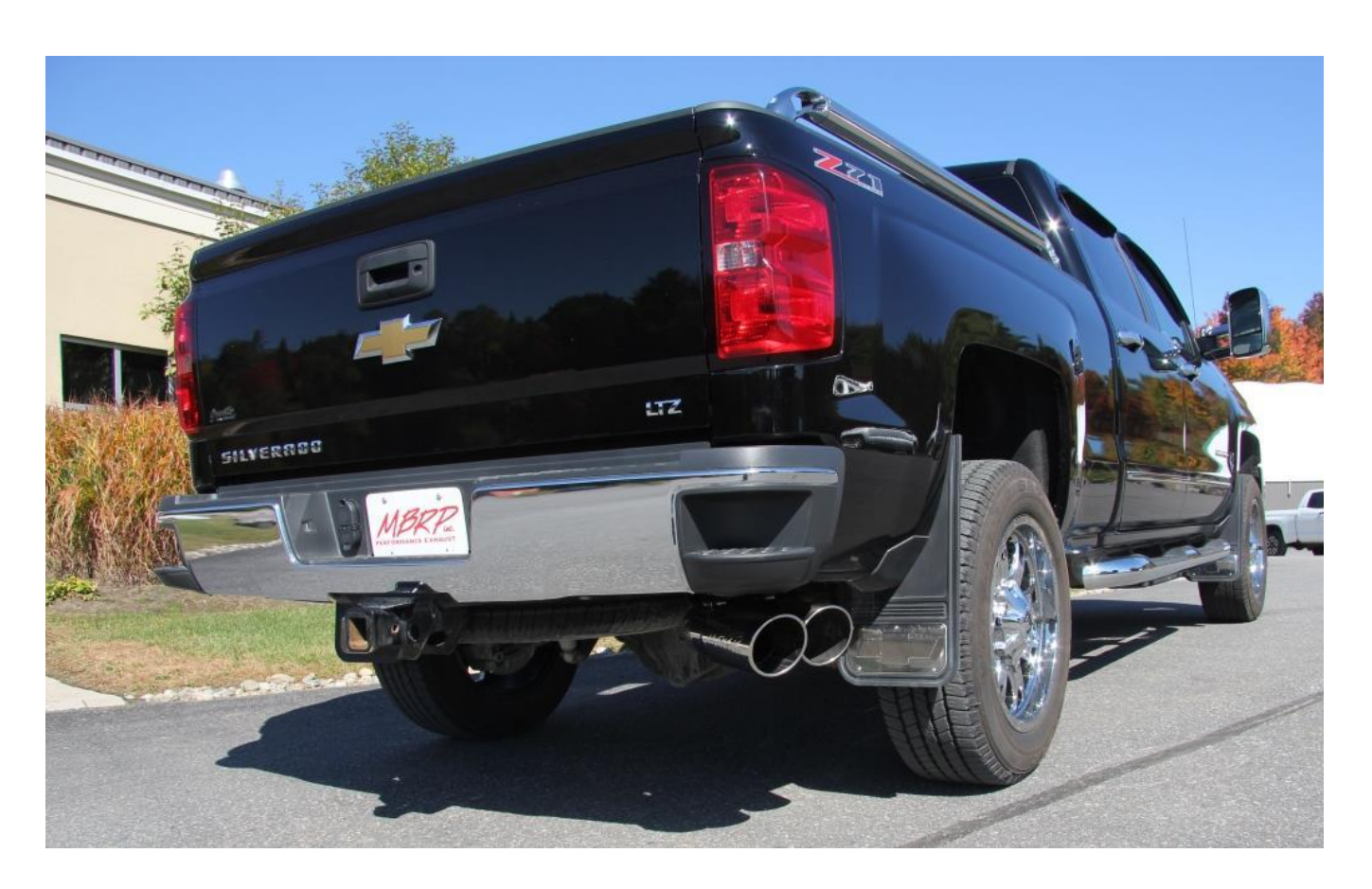
Congratulations! You are ready to begin experiencing the improved power, sound and driving experience of your MBRP Inc. , performance exhaust system. We know you will enjoy your purchase.