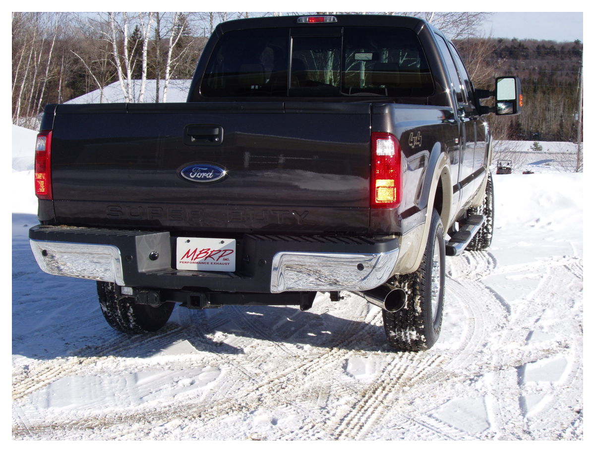
Congratulations! You are ready to begin experiencing the improved power, sound and driving experience of your MBRP Inc. performance exhaust system. We hope you enjoy your purchase.