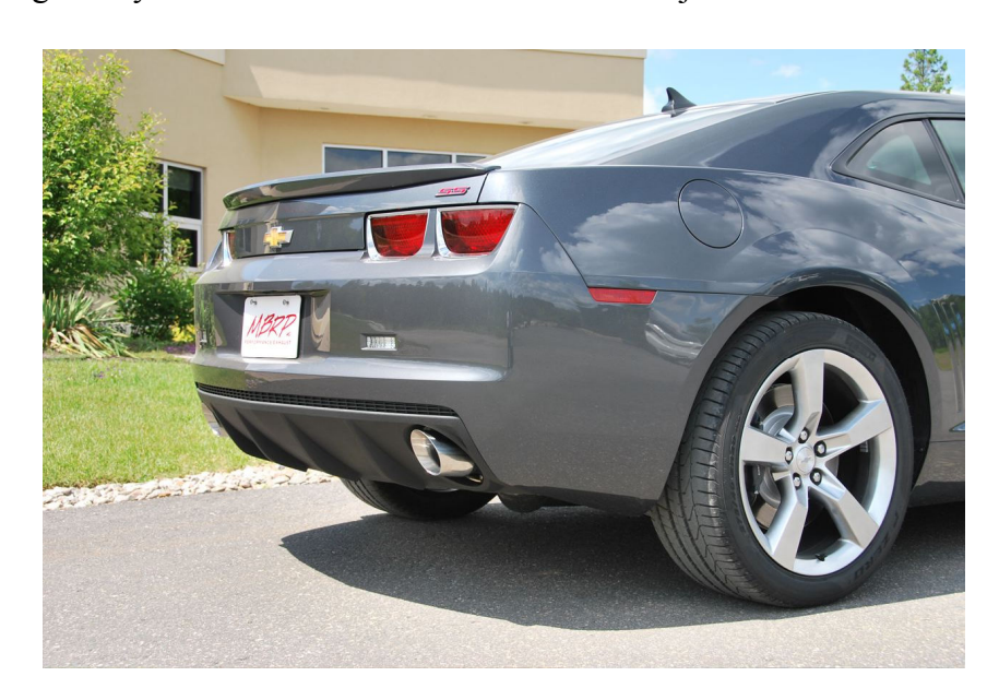
Congratulations! You are ready to begin experiencing the improved power, sound and driving excitement of your MBRP Inc. performance exhaust system. We know you will enjoy your purchase.