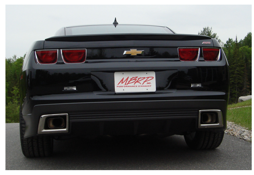
Congratulations! You are ready to begin experiencing the improved power, sound and driving excitement of your MBRP Inc. performance exhaust system. We know you will enjoy your purchase.