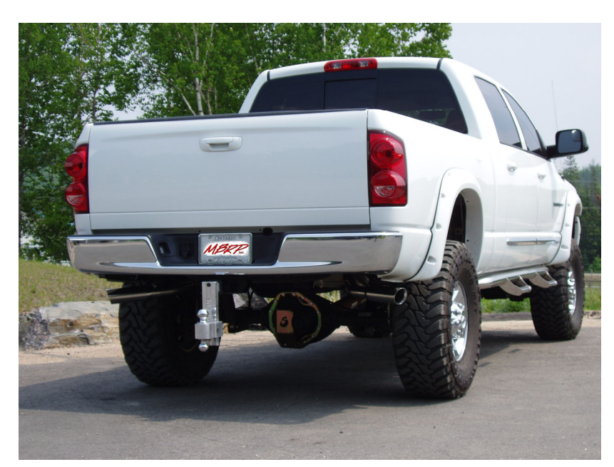
Congratulations! You are ready to begin experiencing the improved power, sound and driving experience of your MBRP Inc. performance exhaust system. We hope you enjoy your purchase.