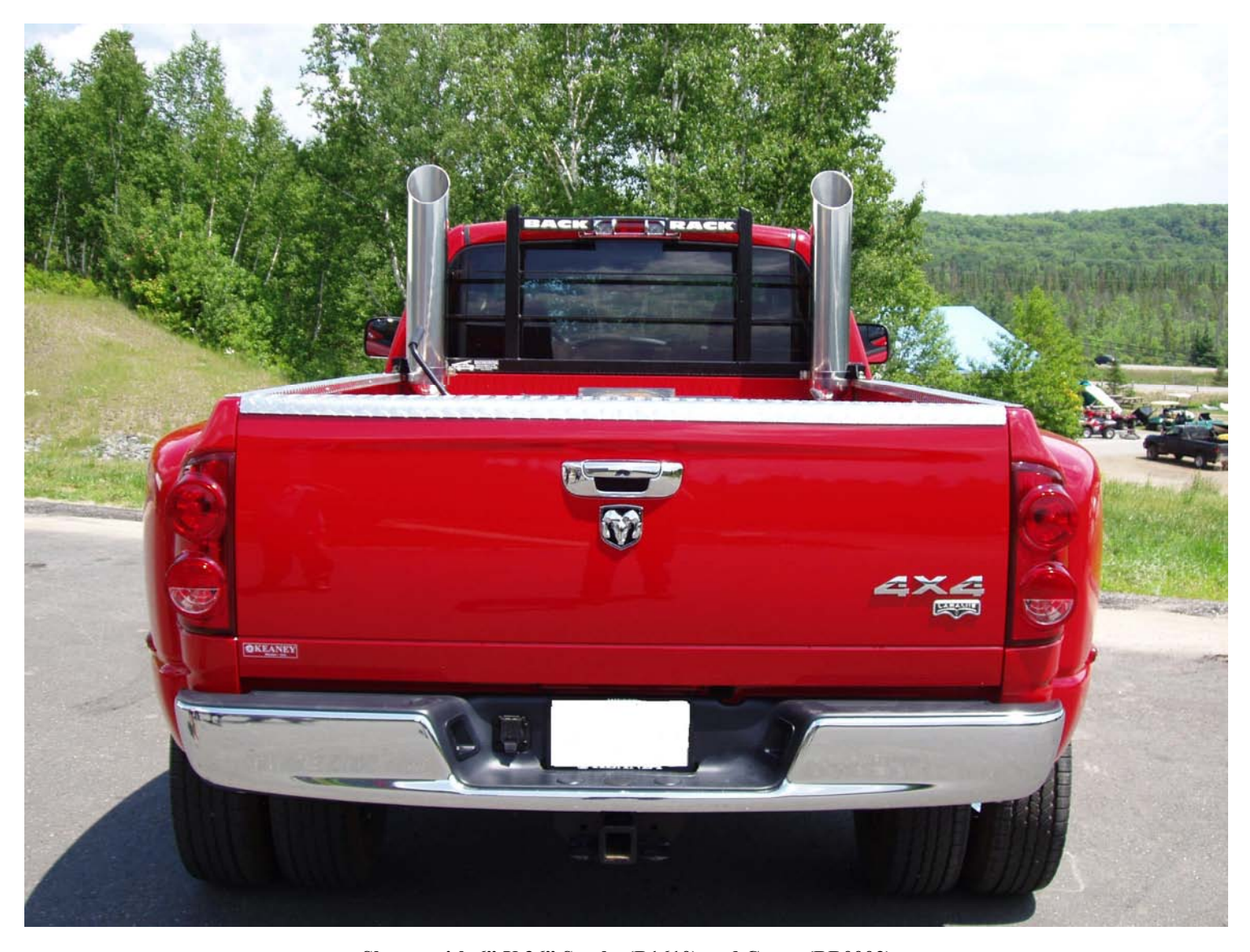
Shown with 6" X 36" Stacks (B1610) and Cover (BB0002)

Congratulations! You are ready to begin enjoying the improved performance and driving experience of your MBRP Inc. "Smokers". We hope you enjoy your purchase.