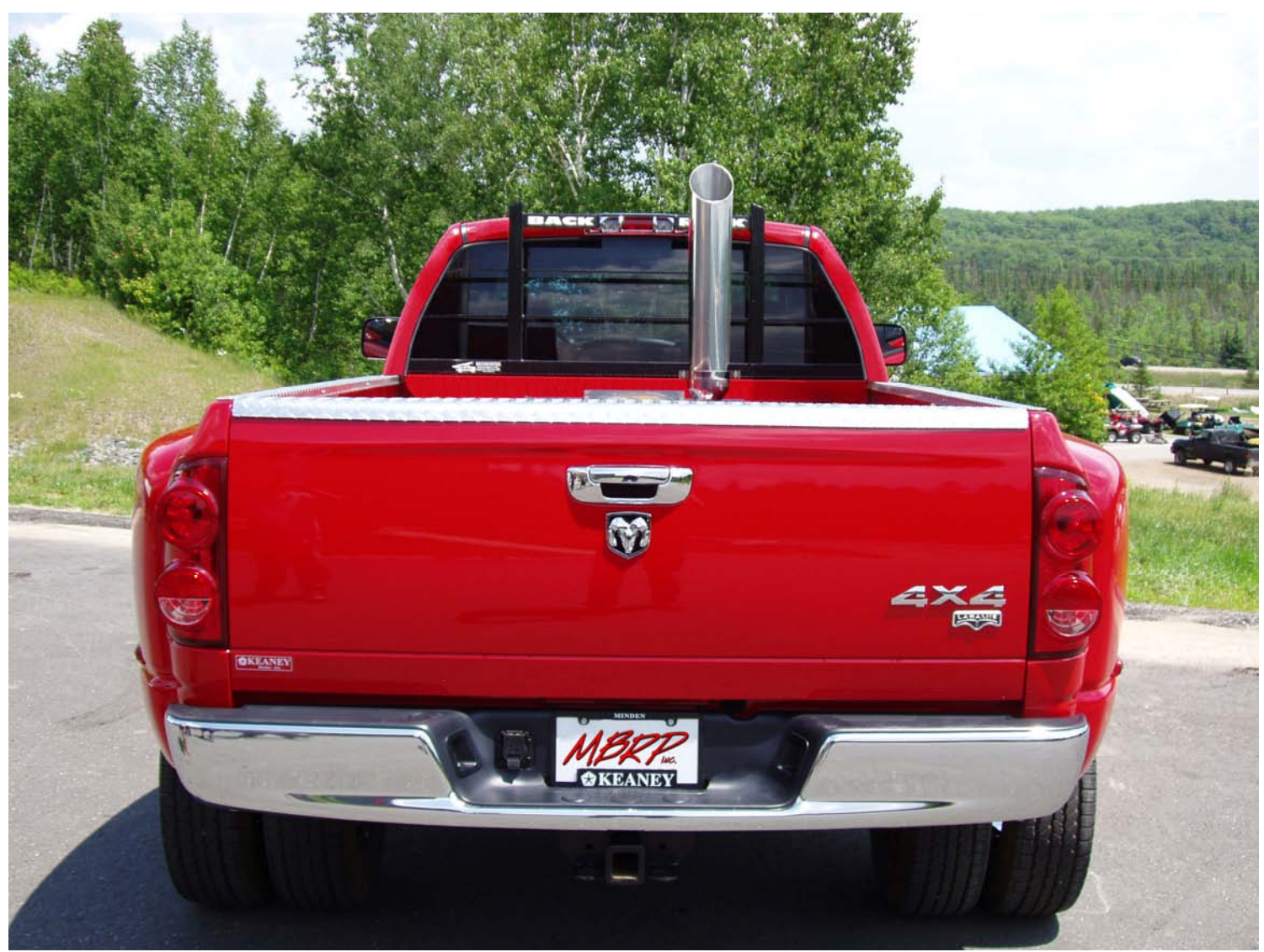
Shown with 6" X 36" Stack (B1610)

8. Check along the whole length of the exhaust system to ensure that there is adequate clearance around fuel lines, brake lines and any wiring. If any interference is detected relocate or adjust.