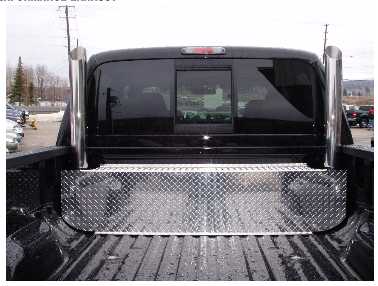
Shown with 4" X 36" Stacks (B1410) and Cover (BB0003)

Congratulations! You are ready to begin enjoying the improved performance and driving experience of your MBRP Inc. "Gmokers". We hope you enjoy your purchase.