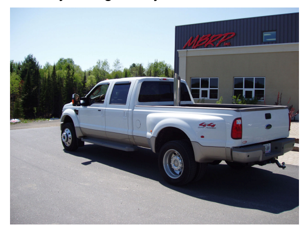
Shown with 6" X 36" Stack (B1610)

Congratulations! You are ready to begin enjoying the improved performance and driving experience of your MBRP Inc. "Gmokers". We hope you enjoy your purchase.