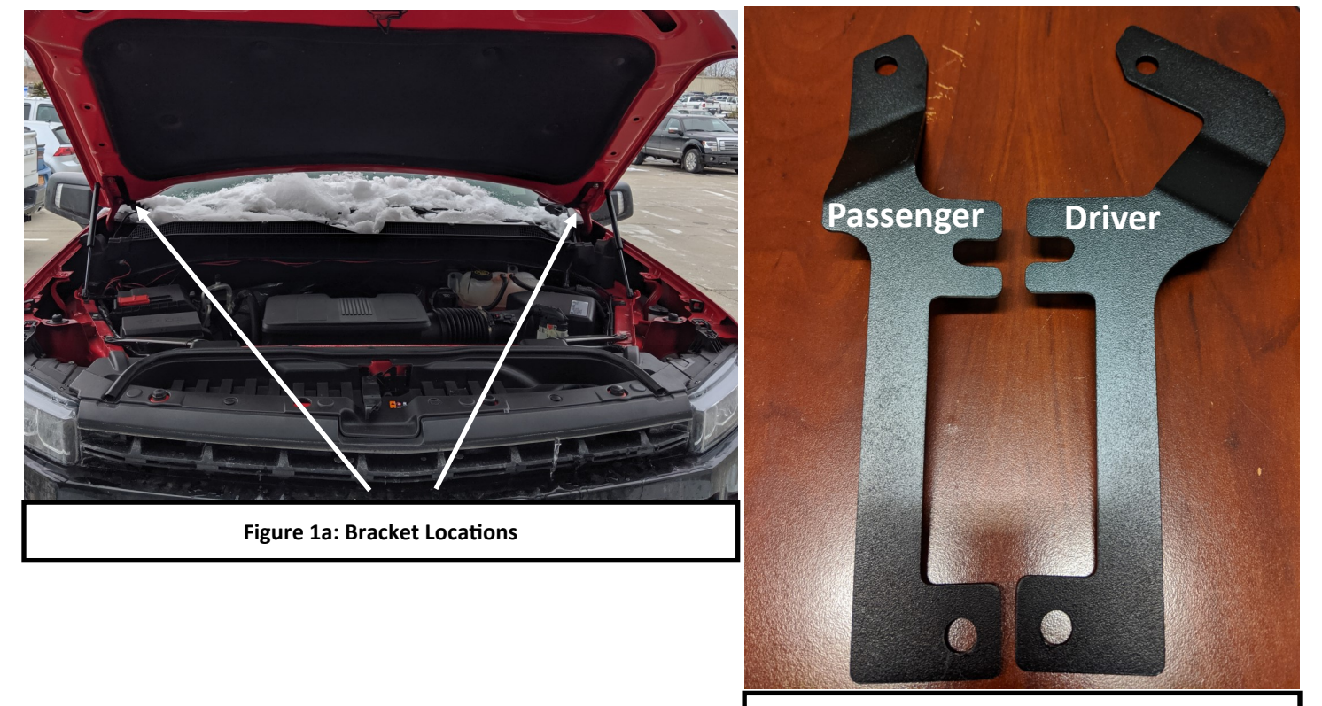
Figure 1b: Bracket Identification

The brackets are designed to utilize the factory mounting locations for the hood hinge. These locations are shown in Figure 1a .