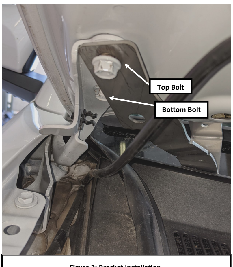
Figure 2: Bracket Installation.

6. Mount light in top hole of bracket (this kit is designed for Putco 10004 or 10007 LED Block Lamps)