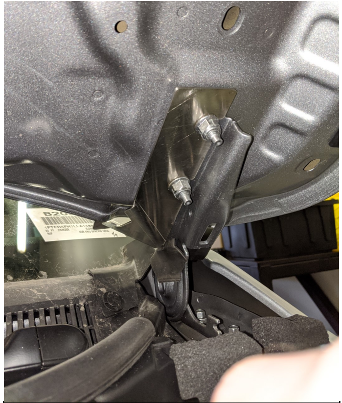
Figure 2: Bracket Installation.