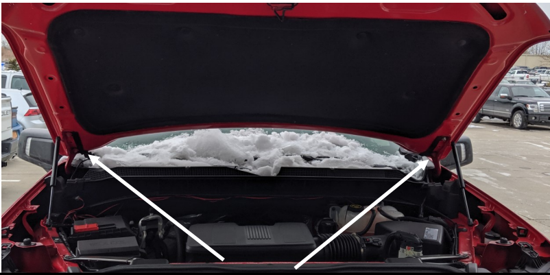
Figure 1a: Bracket Locations

The brackets are designed to utilize the factory mounting locations for the hood hinge. These locations are shown in Figure 1a .