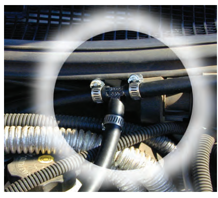
WARNING: The fuel rail and/or fuel lines are under high pressure. Use extreme caution when disconnecting any fuel line. Quickly collect and properly dispose of any excess fuel spillage.