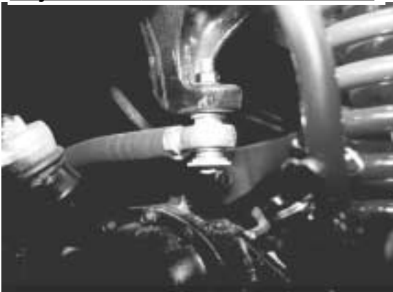
Heavy Duty Tie Rod Tube Part # TR300