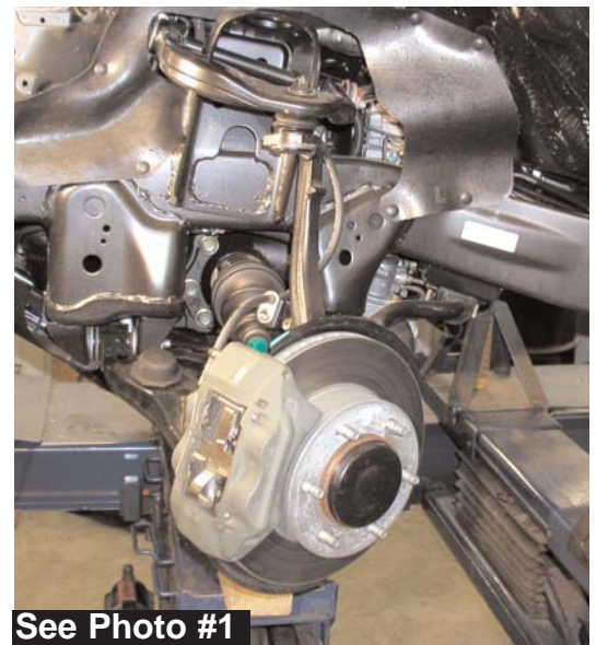
See Photo #1