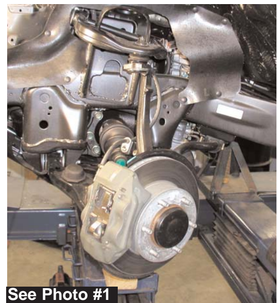
See Photo #1