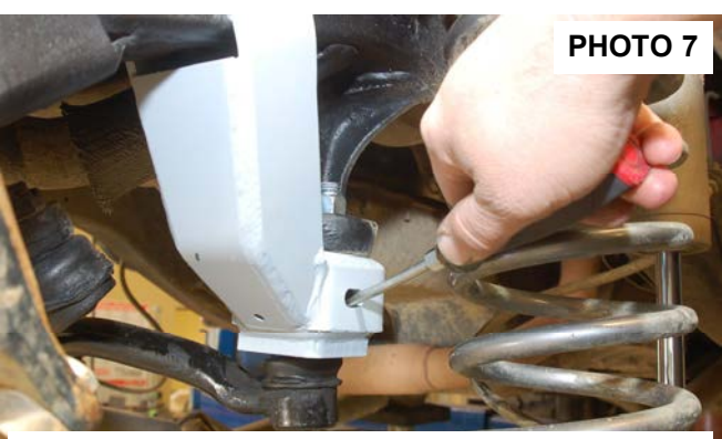
BEND COTTER PIN TO SECURE