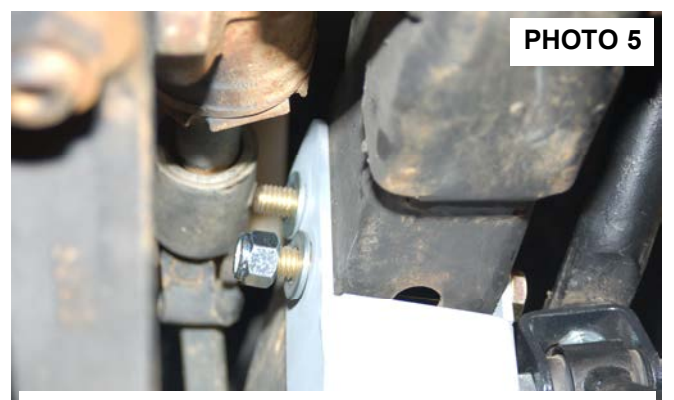
SECURE WITH SUPPLIED 1/2" X 3 1/2" BOLTS