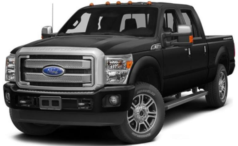
2011-16 F250 6.2L (FT2CB)

Thanks for purchasing a Stainless Works catback exhaust system for your 2011-16 Ford F250 6.2L. Our team has worked to ensure that this product is the premium in performance, quality, and fitment. We are proud to say that this system will unleash the true character of your vehicle. We encourage you to read through the following steps, and check the included Bill of Materials before beginning. Please follow these steps to ensure that your installation goes as planned.