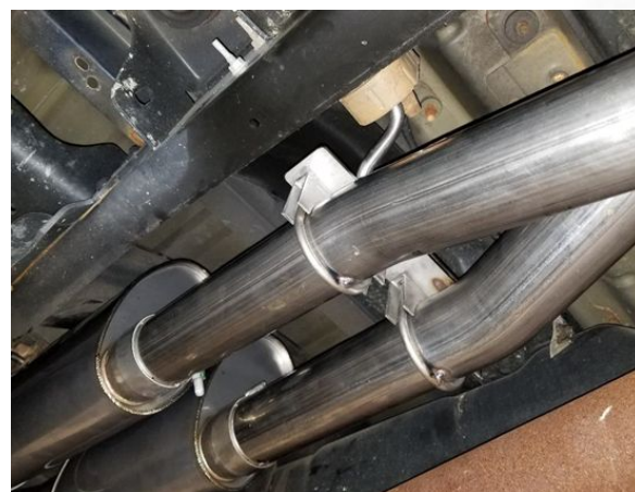
Detail 12: Inlet pipes to mufflers