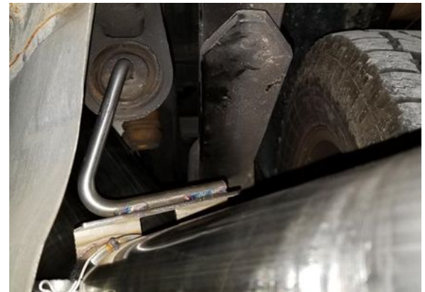
Detail 14: View from rear of vehicle