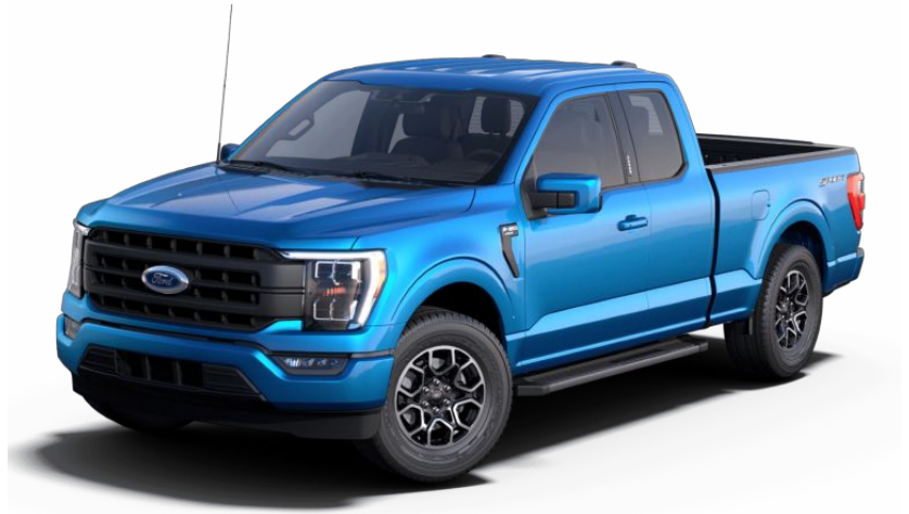
2021+ Ford F-150 (FT21CBYL, FT21CBYR)

Thanks for purchasing a Stainless Works catback exhaust system for your 2021+ Ford F-150 5.0L. Our team has worked to ensure that this product is the premium in performance, quality, and fitment. We are proud to say that this system will unleash the true character of your vehicle. We encourage you to read through the following steps, and check the included Bill of Materials before beginning. Please follow these steps to ensure that your installation goes as planned.