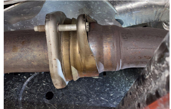
Detail 3: OEM flanged connection point