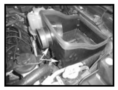
Step 8 Install the heat shield making sure that the tabs on the heat shield are inserted into the lower factory airbox slots. With the heat shield located into the slots, using the 2 factory clips from the airbox, clip the heat shield into position. The center clip will not be used and can be removed if desired.

Assemble the heat shield with the tabs placed on the inside of the heat shield. Install the rubber bulb seal. Place the velocity stack adapter in the heat shield and install the supplied angled coupler making sure the coupler is pushed completely against the heat shield. Take note of the orientation of the funnel, this may be rotated slightly once the filter is installed in the vehicle. Once the adapter and coupler are tight against the heat shield, tighten the clamp.