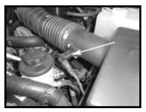
Step 2 Slide the red clip back then disconnect the electrical connector at the Mass Air Flow Sensor (MAFS).

Safety first! Before you begin the installation, make sure that the vehicle is in park (or neutral for a manual transmission) with the parking brake set. Disconnect the negative battery terminal and verify that all components that are listed are present. Note: This kit was designed and tested on a stock engine without any custom tuning done to the engine computer. Removing the battery cable may erase the programmed radio stations. The anti-theft code will need to be entered into some radios after the battery cable is connected. The anti-theft code can typically be found in the owner's manual or at your local dealership.