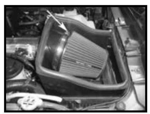
Step 12 Install the supplied air filter and clamp and tighten the clamp that secures the air filter. If needed, rotate the air filter/velocity stack adapter assembly for the maximum clearance as shown.