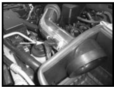
Step 11 Reconnect the MAFS electrical connector.