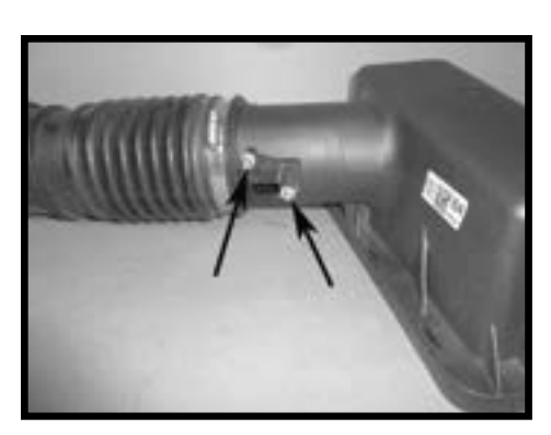
Step 5 Remove the MAFS from the factory intake tube