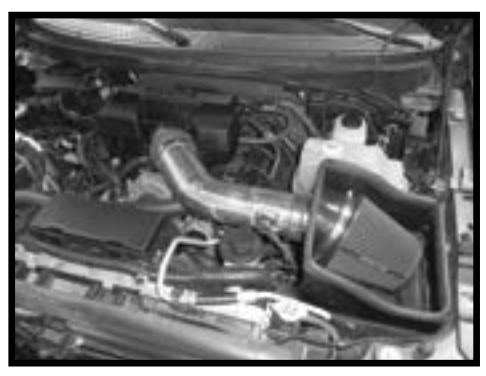
Step 13 Make sure that all clamps and hardware are fully tightened. Reconnect the battery cable and start the engine and let it warm up. Shut it off and inspect the installation once more for any loose clamps, wires, or hardware. Test drive & enjoy! Your installation is now complete. Periodically check all clamps and brackets.