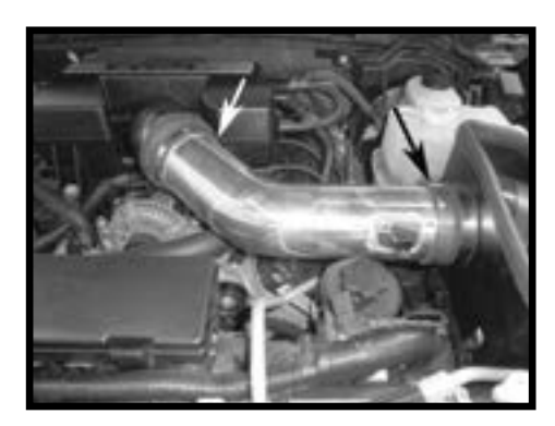
Step 10 Install the Spectre Performance intake tube into the coupler on the heat shield then into the flex coupler on the throttle body. Fasten securely in place