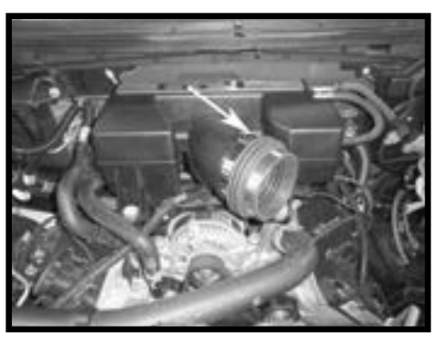
Step 9 Install the flex coupler on the plenum and secure the coupler in place. Install a second clamp but do not tighten at this time.