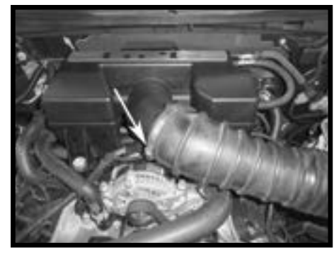
Step 3 Loosen the clamp on the tube going to the plenum and disconnect the intake tube from the plenum.