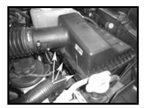
Step 4 Unclip the three hold down clips on the air filter lid, lift the lid then slide it forward to clear the locking tabs. Remove the air filter lid/intake tube assembly and air filter.