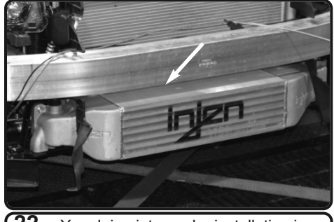
22. Your Injen intercooler installation is now complete. Make your final adjustment and make sure all your nuts, bolts and clamps are secure. Reinstall the rest of the bumper components in reverse order.