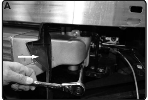
20. Re-install the OEM screws and secure the injen intercooler.