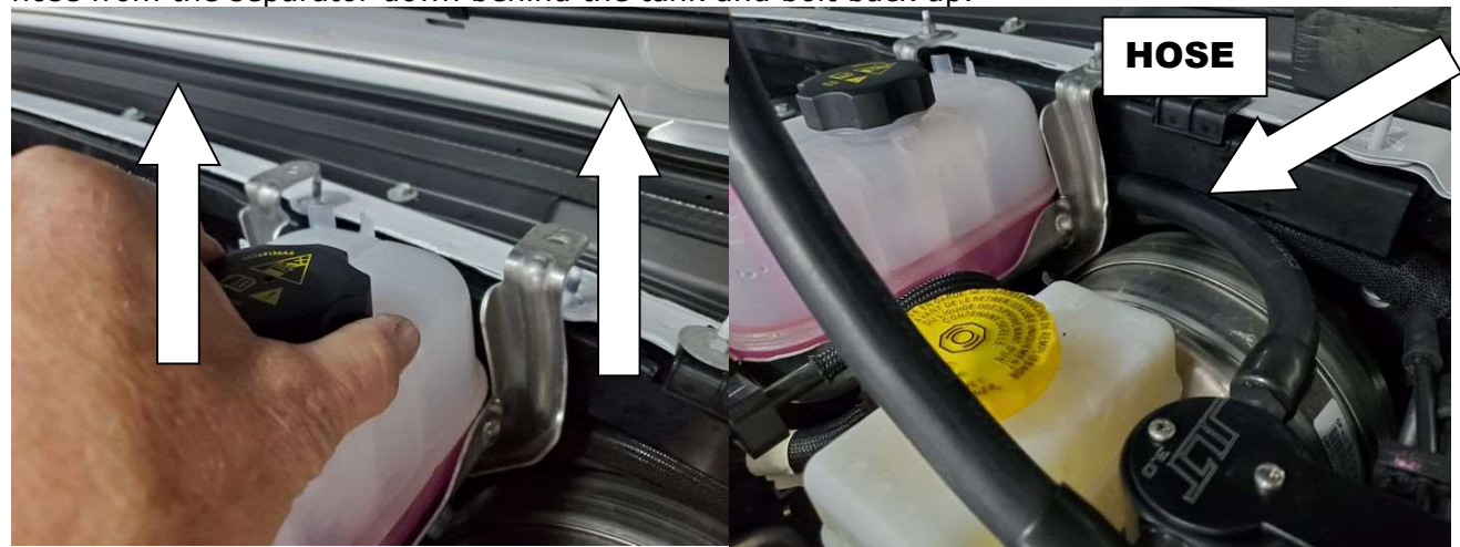
Use the 2 supplied M4x10 screws to mount the separator to the bracket Remove the (2) 10mm nuts holding down the coolant overflow tank, lift tank up and route long hose from the separator down behind the tank and bolt back up.