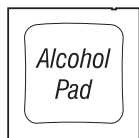
Alcohol Pad x2