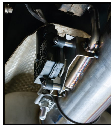
VALVE INSTALLED SHOWN ABOVE