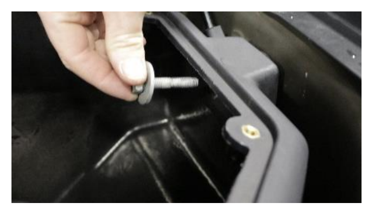
5. Attach the Volant air box to the fender with the bolt from Removal Step 4 using a ratchet and 13mm socket.

4. Install Volant air box into the vehicle by inserting stems on bottom of Volant air box into factory grommets.