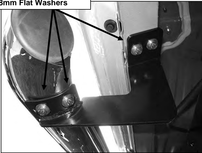
(Fig 3) Driver side rear Bracket pictured

8mm x 30mm Hex Bolts 8mm Lock Washers 8mm Flat Washers