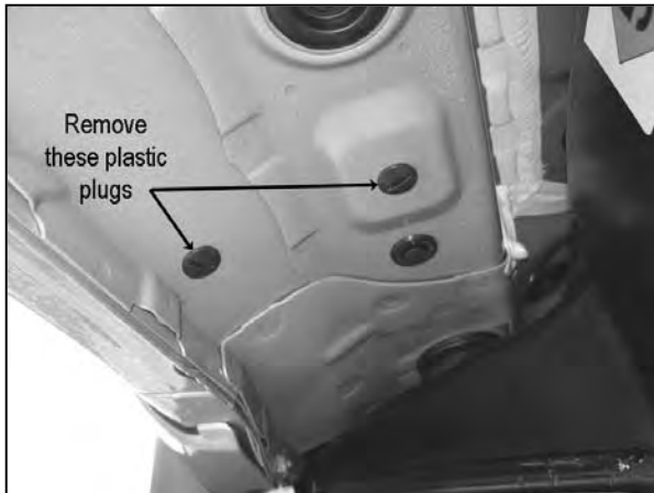
(Fig 1) Driver side front mounting location

8mm x 30mm Hex Bolts 8mm Lock Washers 8mm Flat Washers